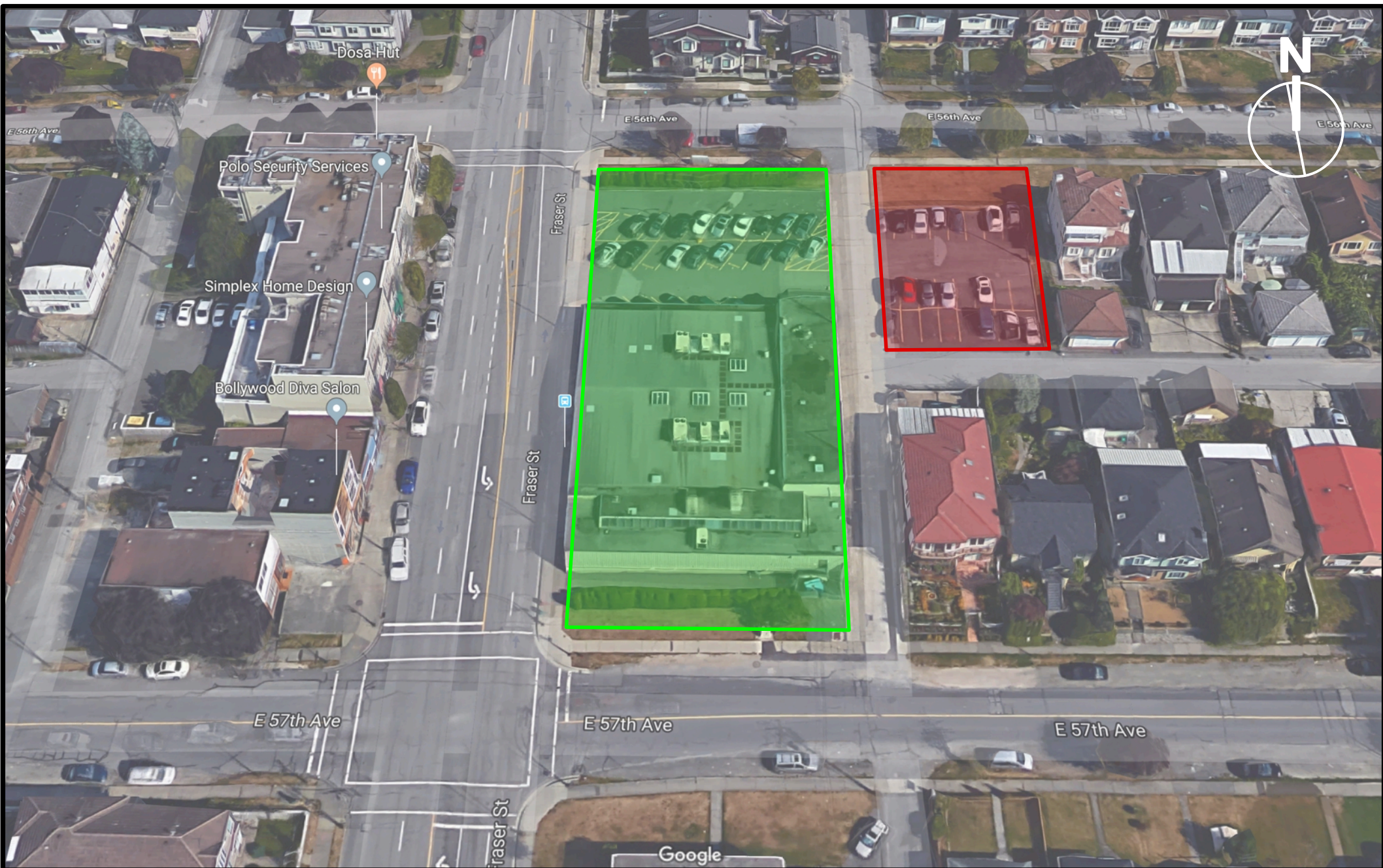
1 Aerial Imagery