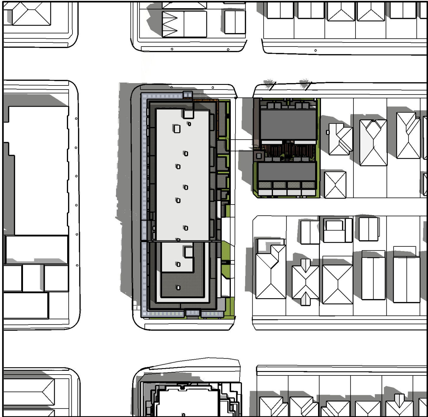
JUNE 22nd - 10am