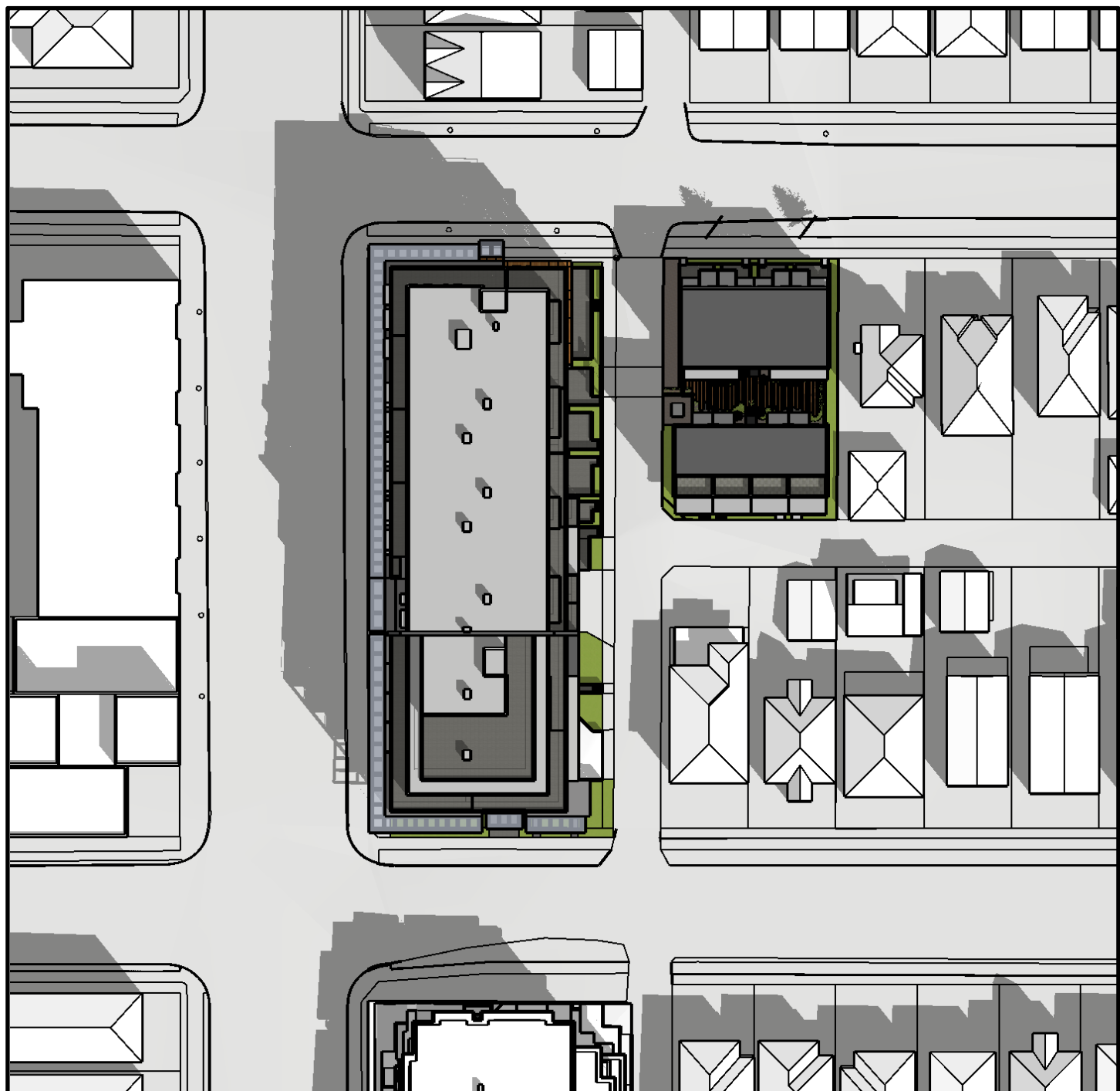
SEPTEMBER 22nd - 10am