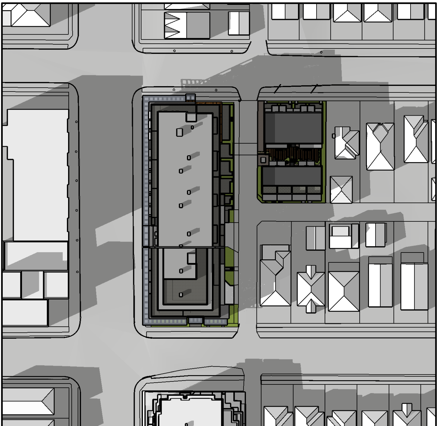
SEPTEMBER 22nd - 4pm