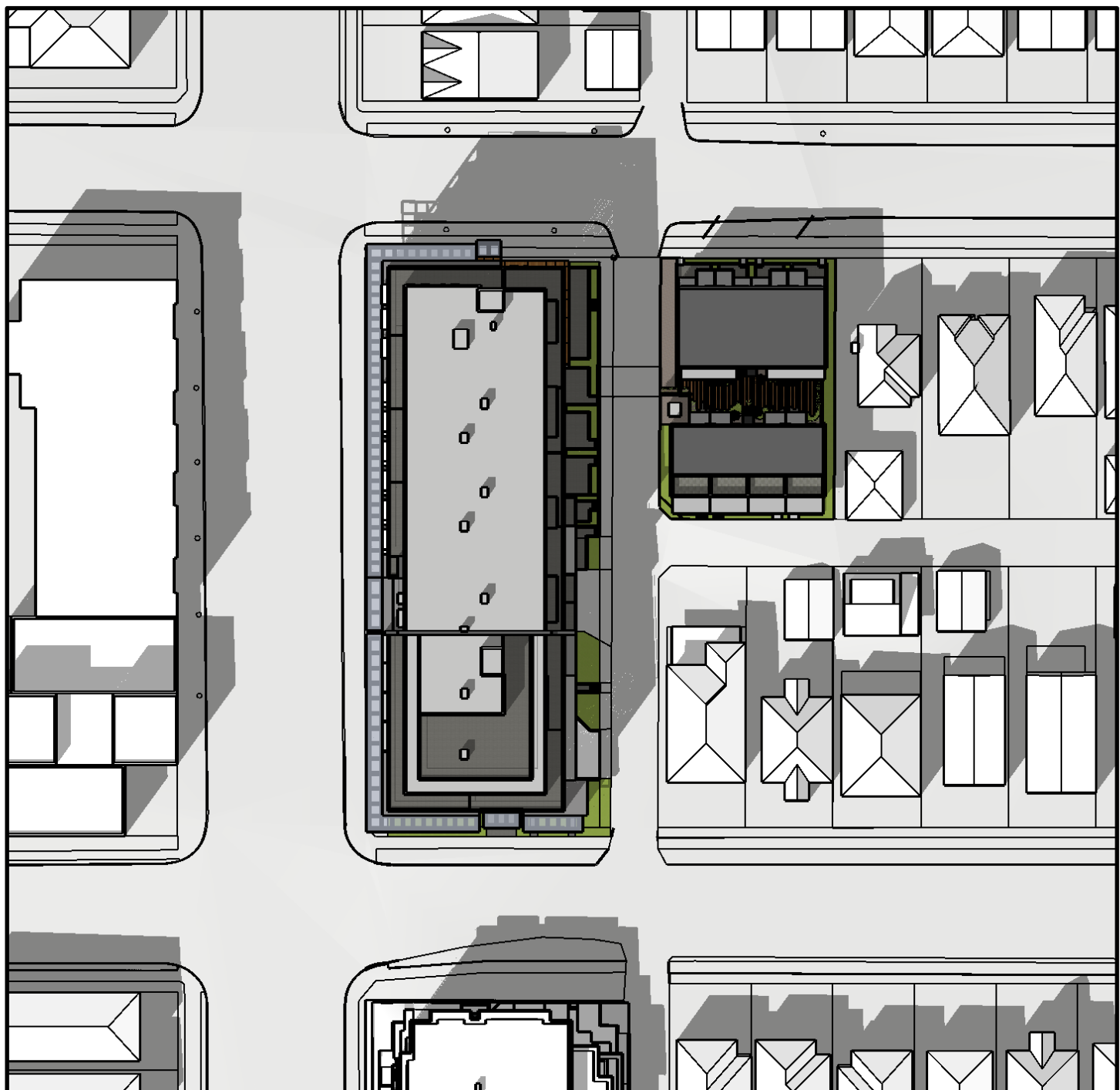
SEPTEMBER 22nd - 2pm