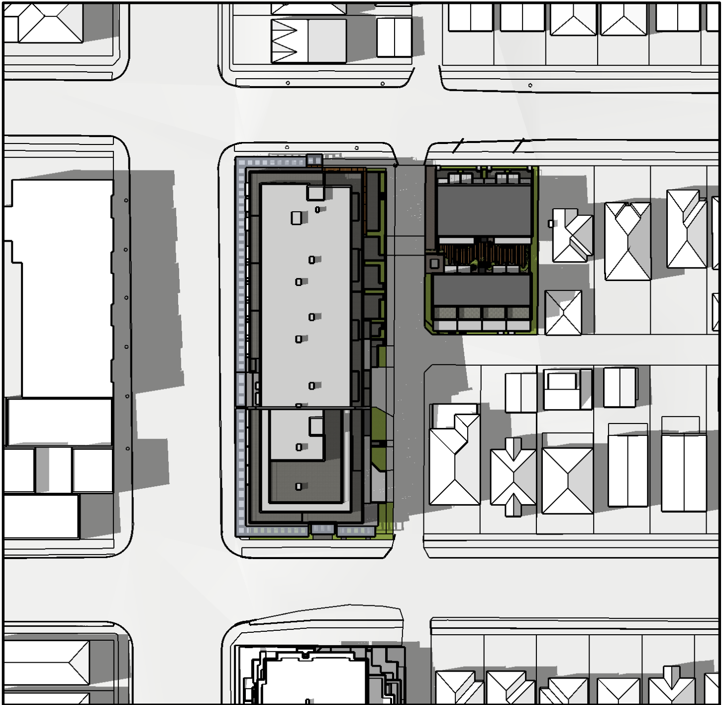
JUNE 22nd - 4pm