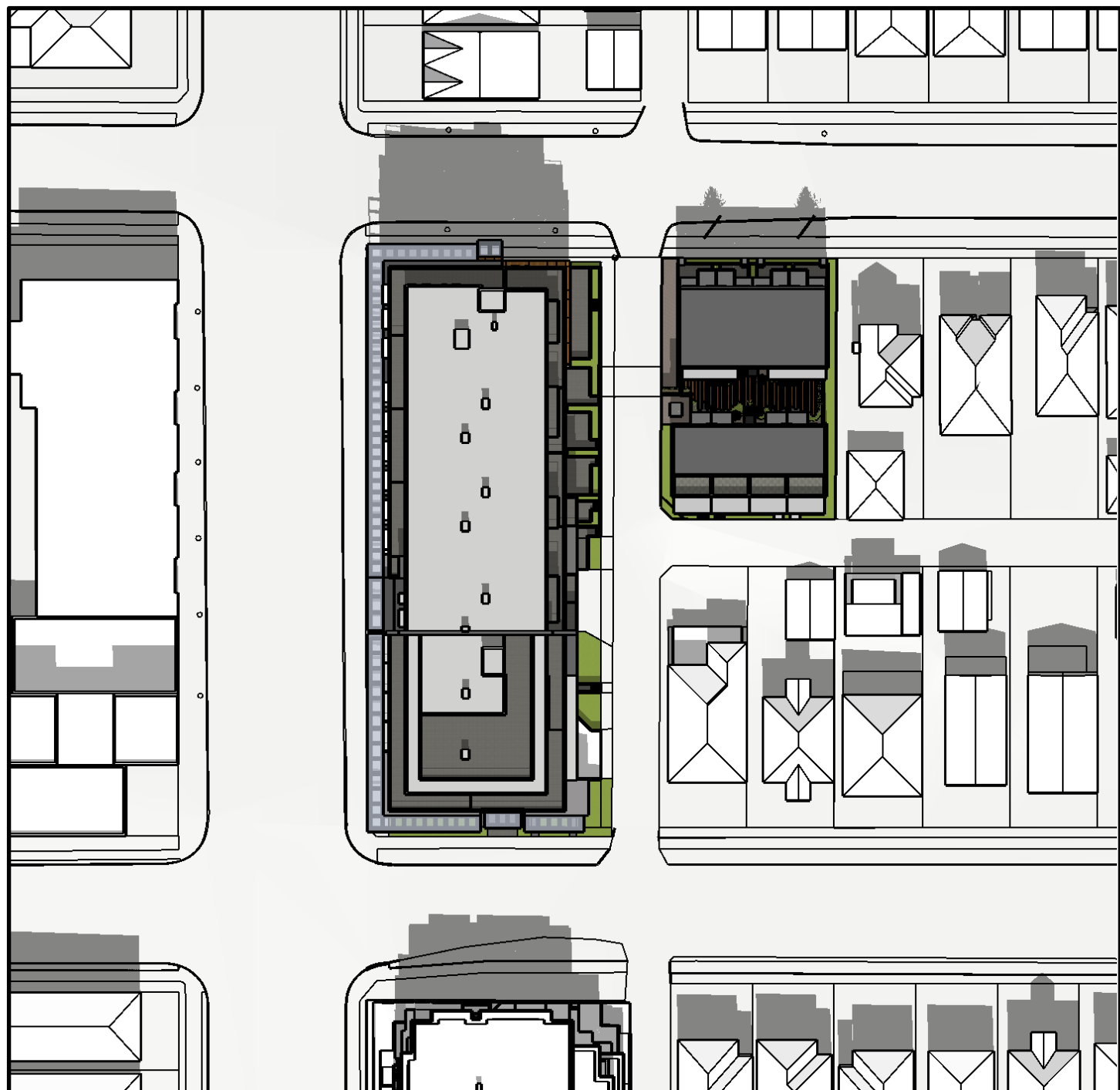
SEPTEMBER 22nd - 12pm