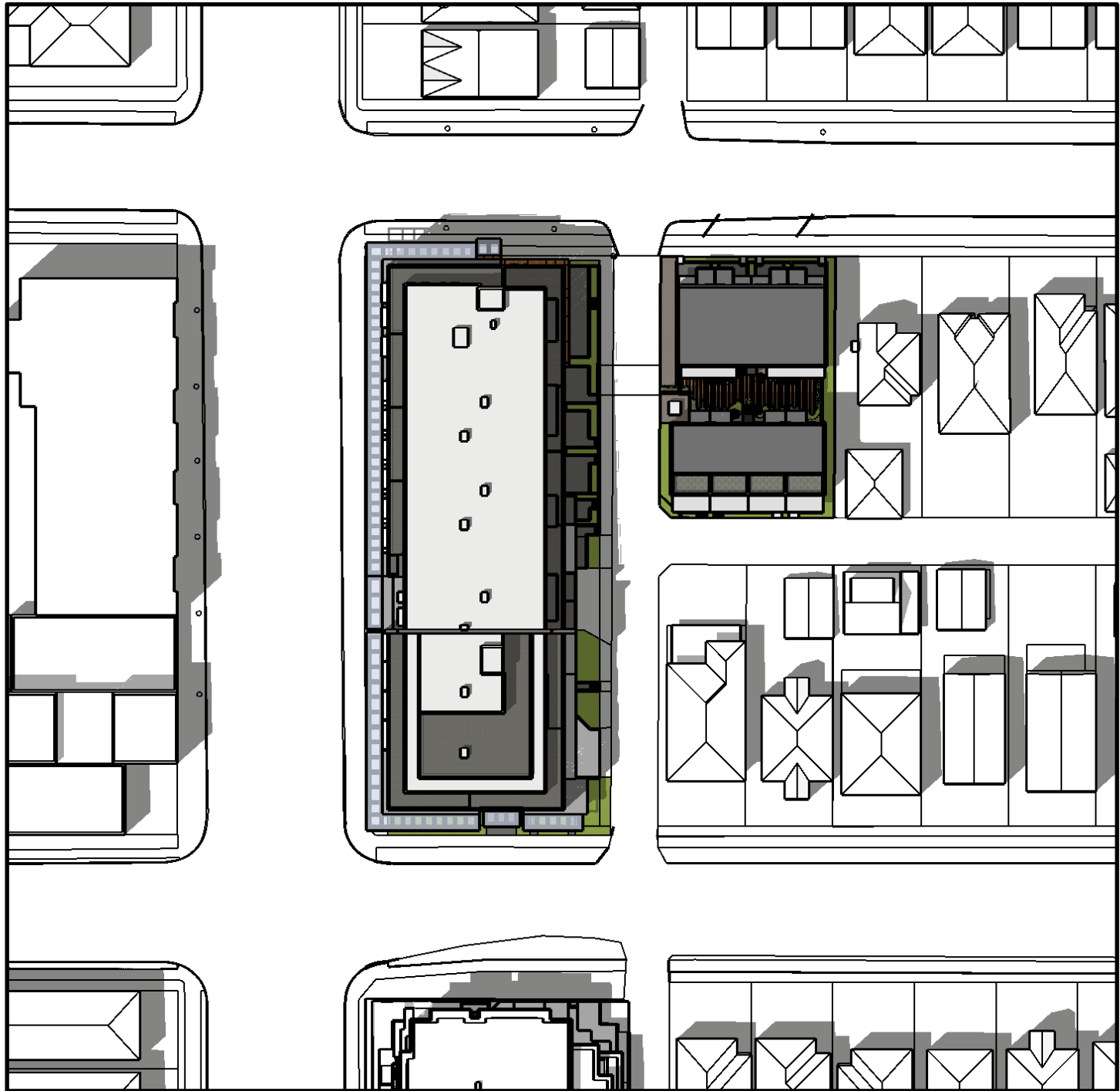
JUNE 22nd - 2pm