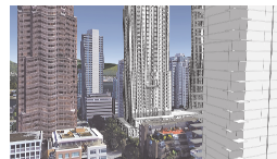
Existing View North-East