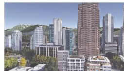
Existing View North-East

Proposed Towers not constructed and not included in view