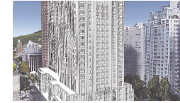
Existing View North-East

Proposed Towers not constructed and not included in view