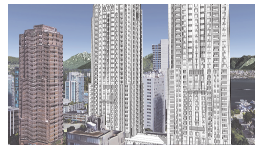
Existing View North-East

Proposed Towers not constructed and not included in view