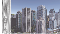
Existing View North-East