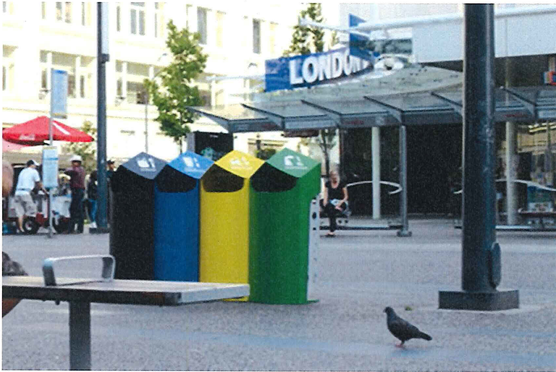
Example of recycling station with 4 receptacles