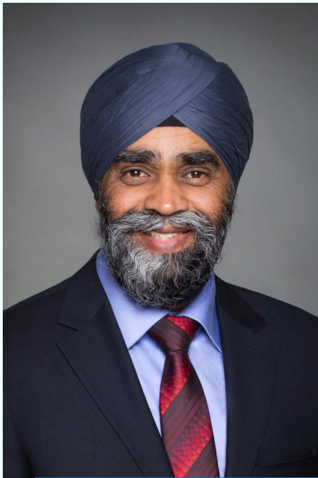
The Hon. Harjit Sajjan