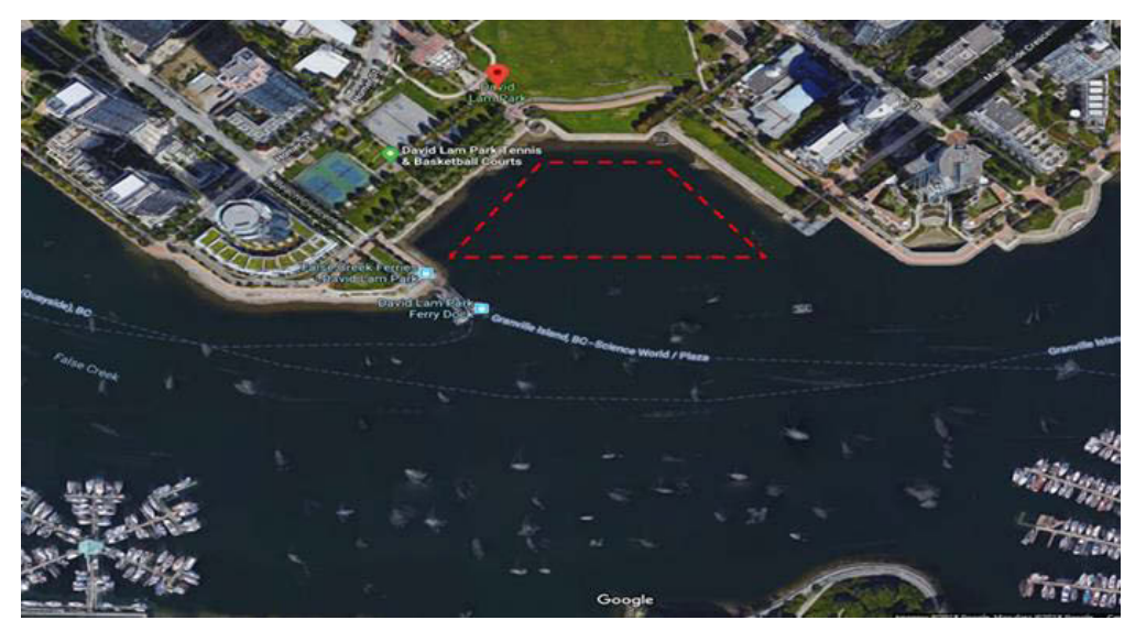
Figure 1: Physical location for the proposed swimming activation.

David Lam Park is located in Downtown Vancouver on the north side of False Creek, opposite Charleson Park. The proposed location is approximately 9000m² in size and falls within two water lots on the south side of the park in central False Creek. The proposed location is sheltered from the busy False Creek vessel traffic and features comparatively favorable water currents compared to east False Creek. The proposed location and swimming activation area is outlined on Figure 1 below.