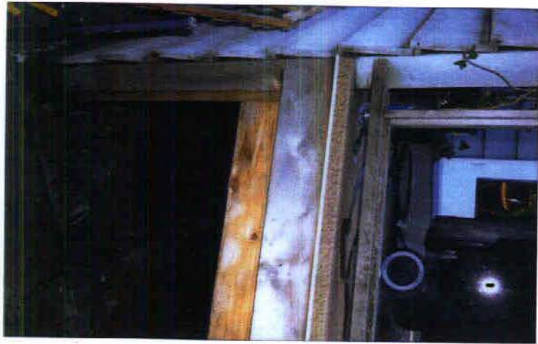
① SITE BEFORE TANK REMOVAL.