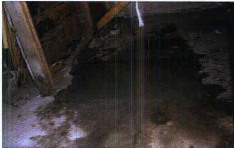
③ VIEW OF SITE AT COMPLETION