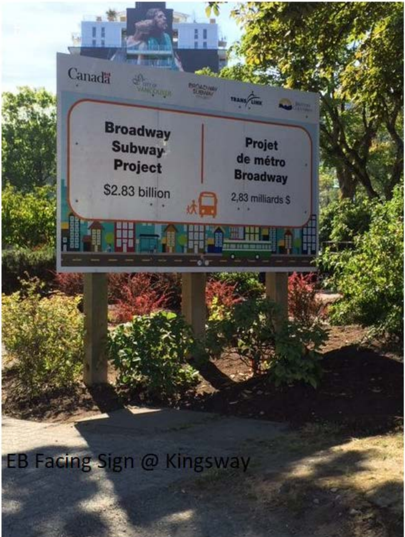
EB Facing Sign @ Kingsway