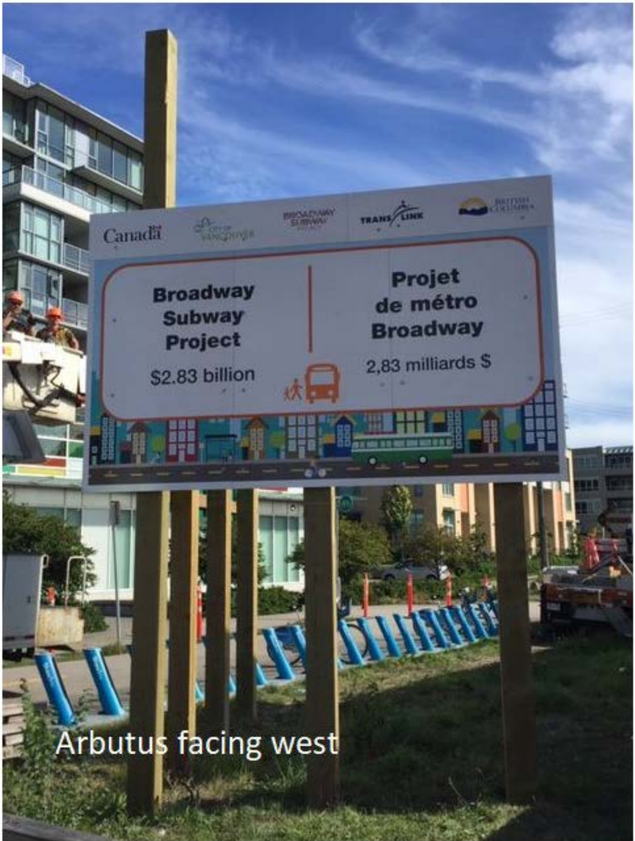
Arbutus facing west