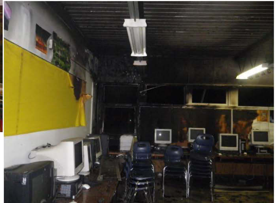
Eric Hamber Annex - 2011 ($410,000 damage)