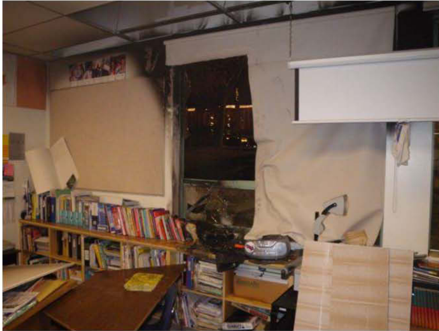
Trudeau Elementary -2010