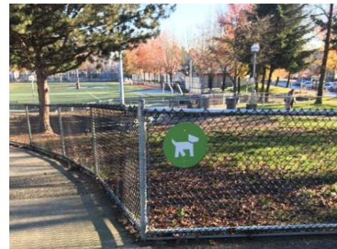
Figure 3: Andy Livingstone off-leash sign