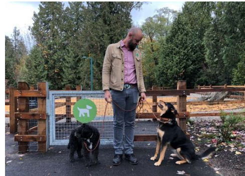
Figure 2: Renfrew Park dog off-leash area

Renfrew Park New Dog Off-Leash Area (completed October 2018) – created a new fully enclosed 0.14 hectare off-leash area in a portion of an underused parking lot; includes two double gates and various amenities, including a walking path, benches, picnic tables, dog play features; and various surface materials (see Figure 2).