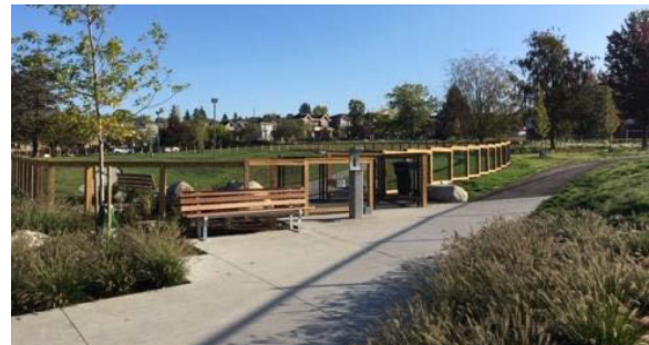
Figure 1: Upgraded Sunset Park off-leash area.

Sunset Park Dog Off-Leash Area Renewal (completed 2018) – first project to incorporate the strategy's design guidelines; includes various surface materials, looping path, formal & informal seating, shade, and drinking water for people & dogs (see Figure 1).