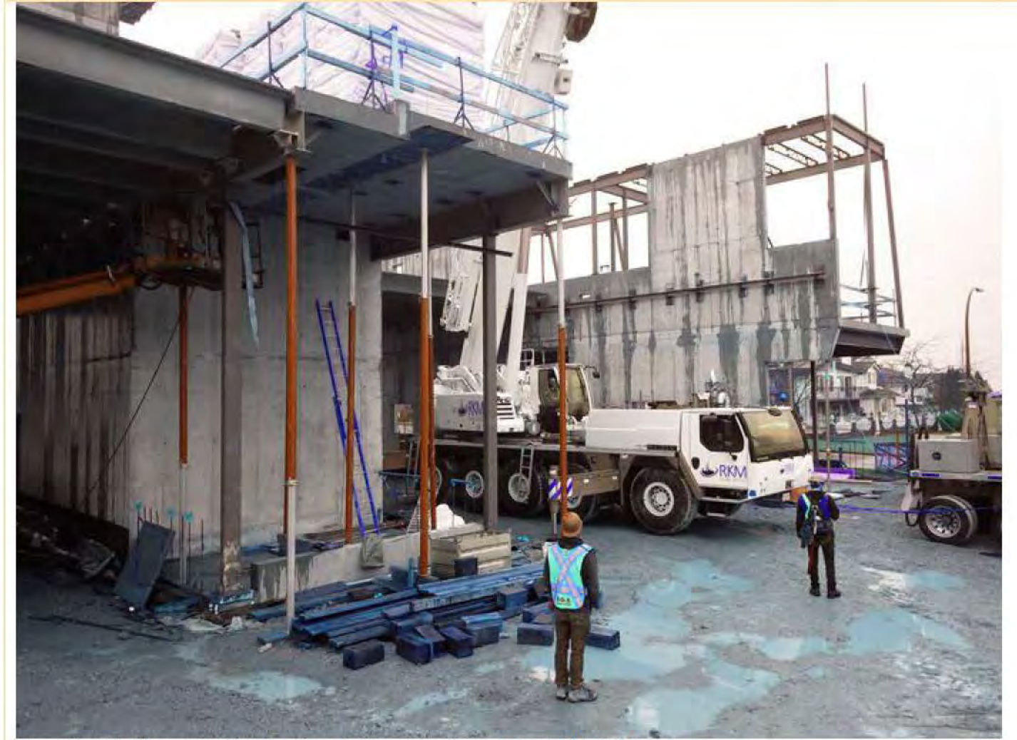
Crane truck in Apparatus Bay location placing precast concrete double "T" beams