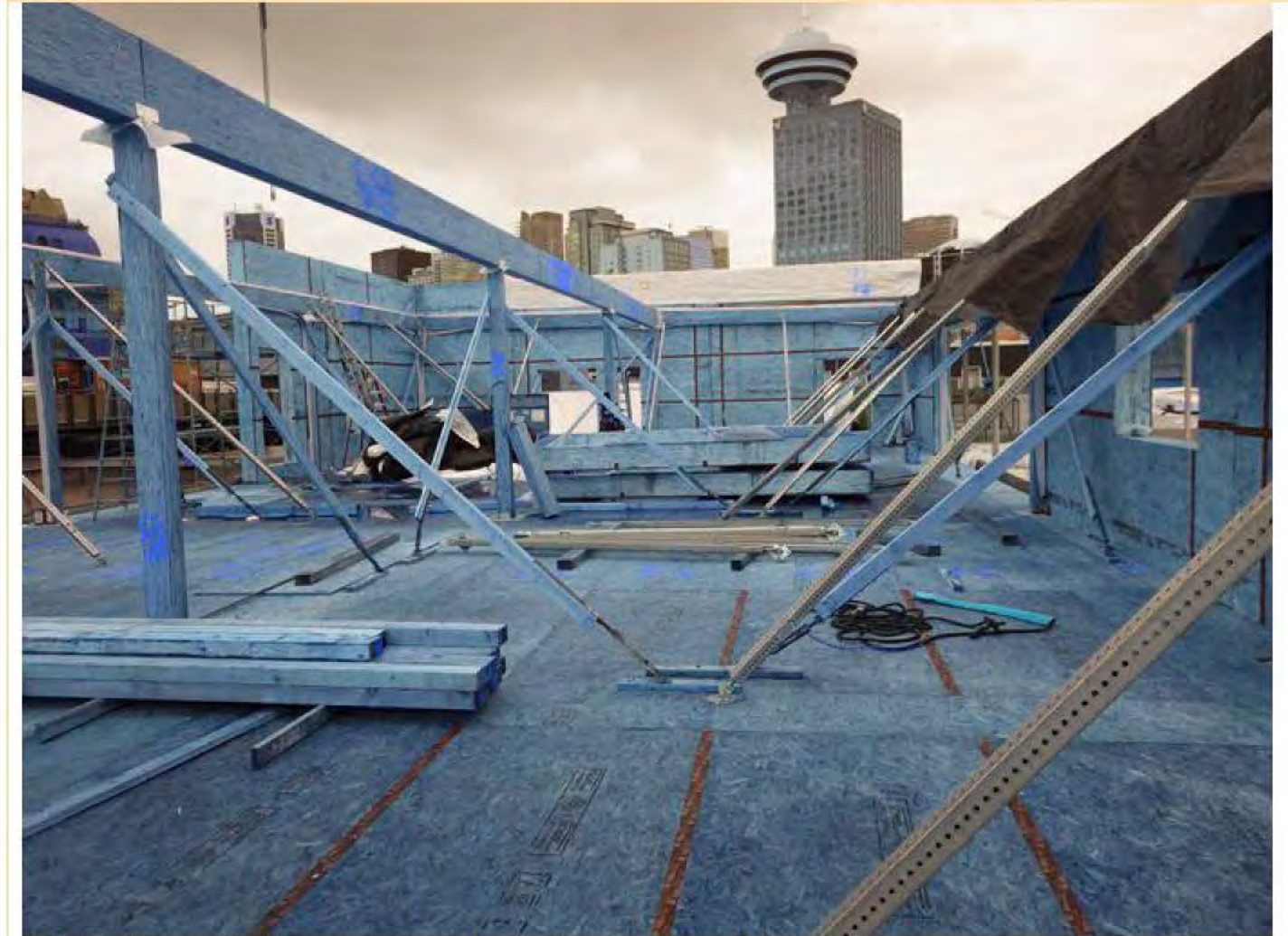
Prefabricated Passive House panels/"cassettes" and composite wood posts and beams