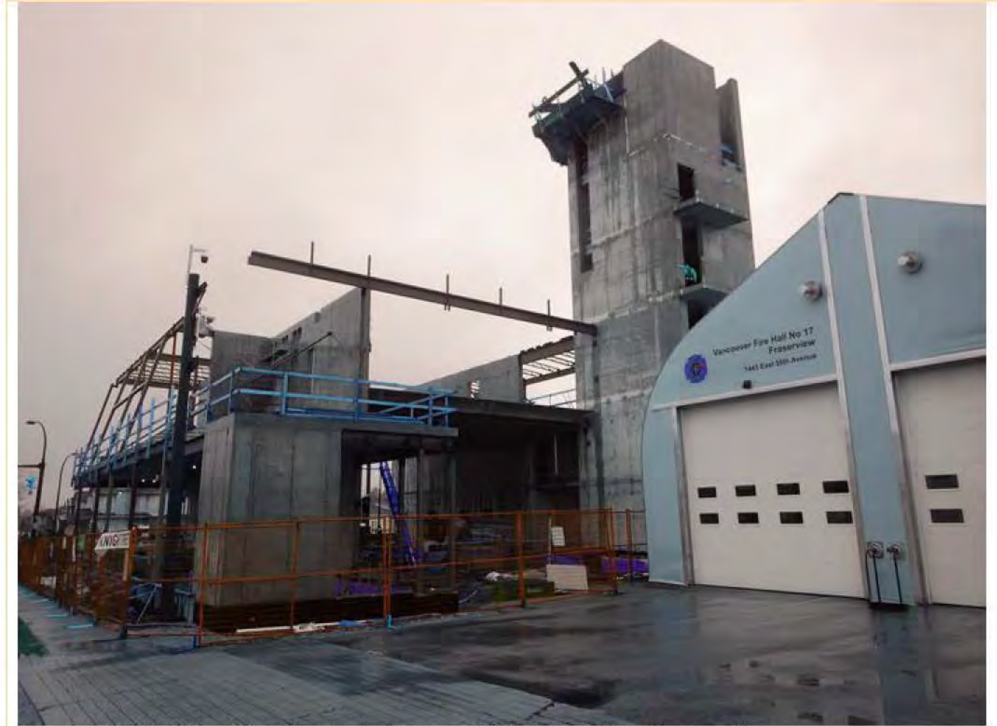
Hose tower full height; steel framing going in (temporary FH 17 truck shelter in foreground)