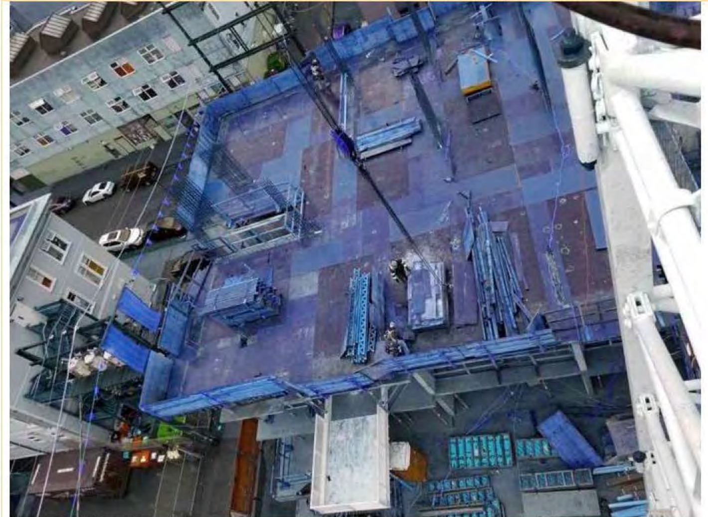
Looking South from Crane