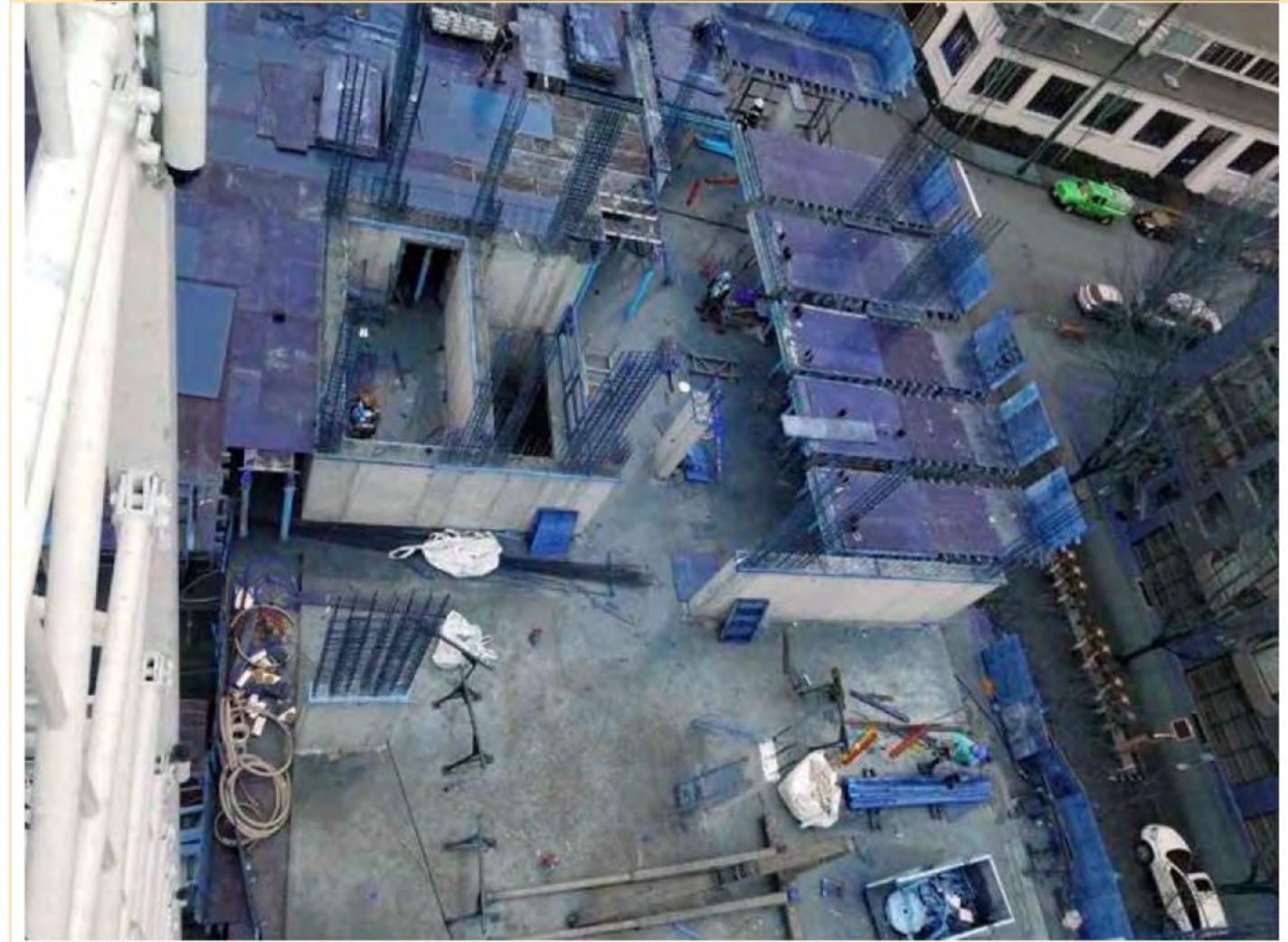
Looking West from Crane