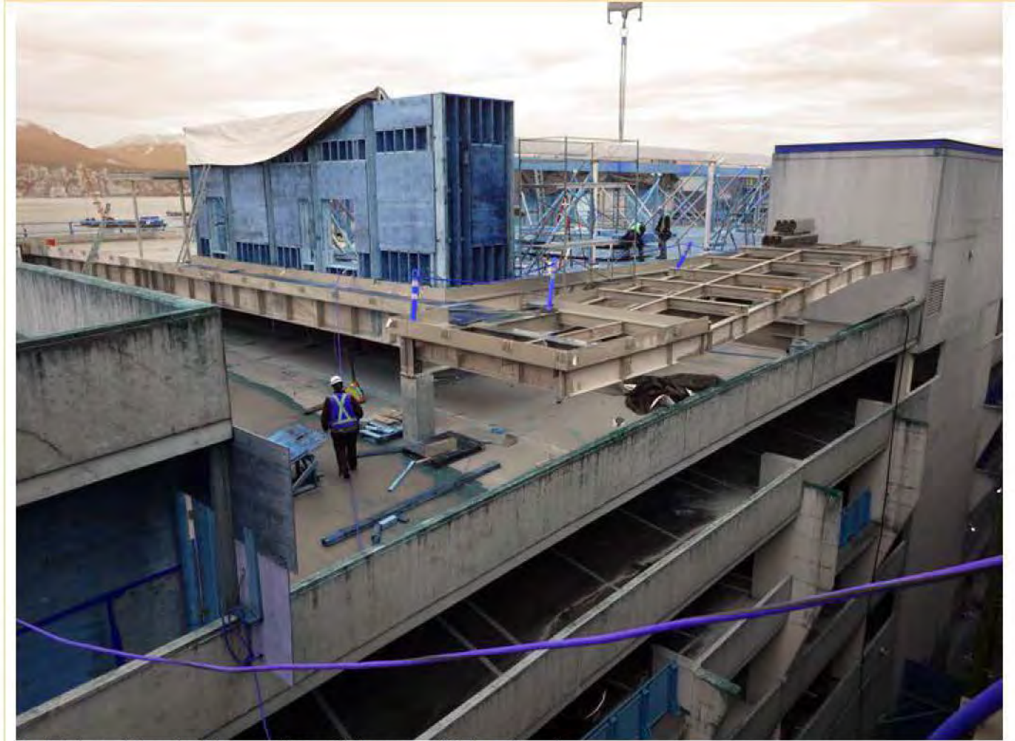
Prefabricated Passive House wall panels/"cassettes" being placed