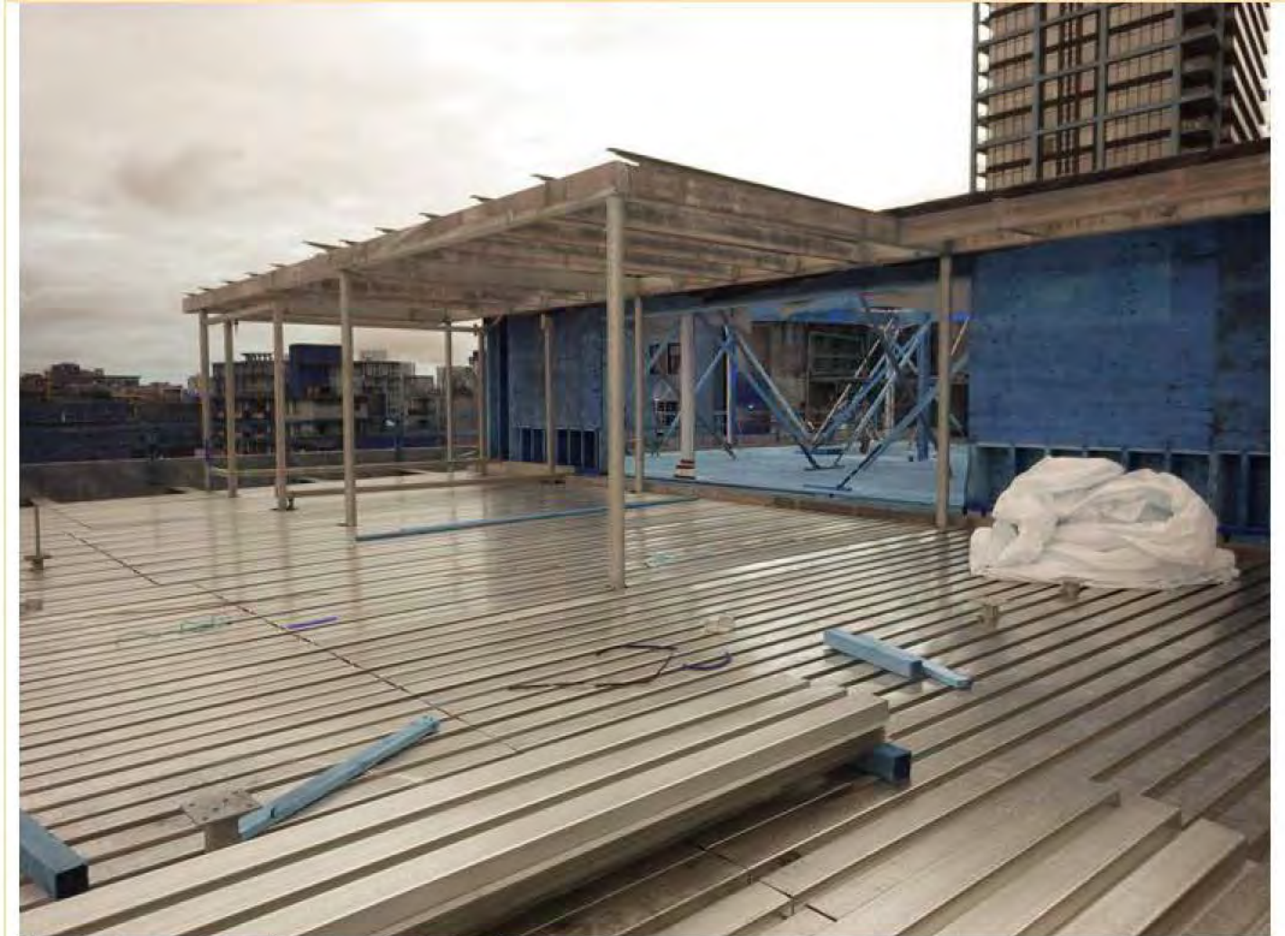
Framing for covered and uncovered exterior play area