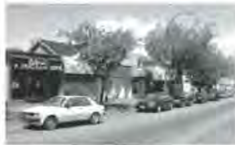
Rupert and 22nd shopping area