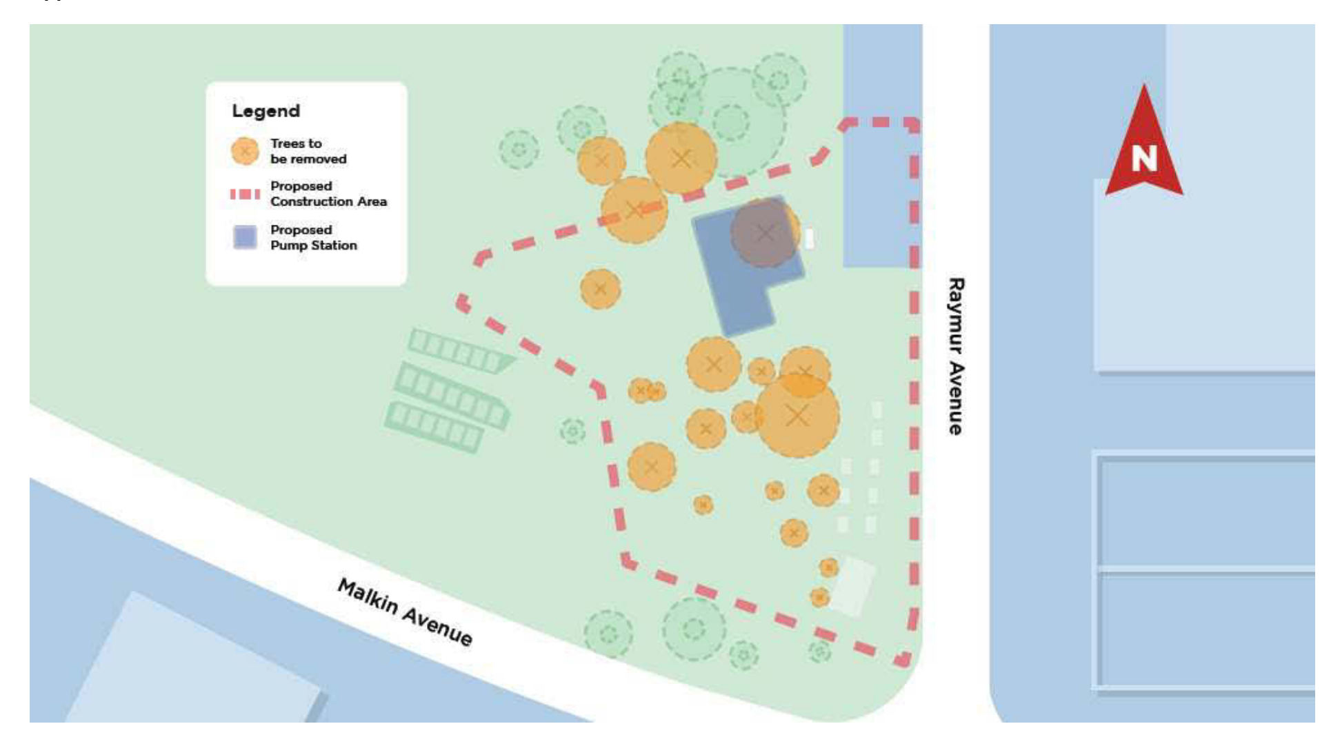
Appendix A: Tree Removal - Plan View