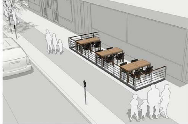
8X3M LARGE SIDEWALK PATIO $230 APPLICATION FEE + $2,208 FOR 24M 2 = $2,438 TOTAL

If you have any questions, please feel free to contact me directly.