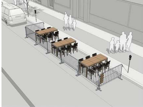
9X1.8M CURBSIDE PATIO $230 APPLICATION FEE + $1,574 FOR 17M 2 = $1,804 TOTAL