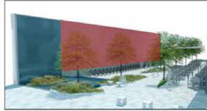
Draft Public Art Plan – Burrard Place (Ballard Fine Art), June 26, 2017

The Mews Wall along the pedestrian mews has been identified as the fourth public art opportunity. A "green wall" landscape treatment is proposed for the Mews Wall and the artwork may incorporate aspects of the green wall, possibly as a background treatment. Alternately, it may be possible for the artwork to take the place of the green wall. The artwork may include a wide range of content and form, with innovative approaches and materials, including 2D and other media. The wall along the mews measures approximately 99' long and 20' high. A bike share measuring approximately 92'-6" long and 6' high is located along the wall of the mews. The artwork will be sited on the wall measuring approximately 14 ft. in height above the bike share.