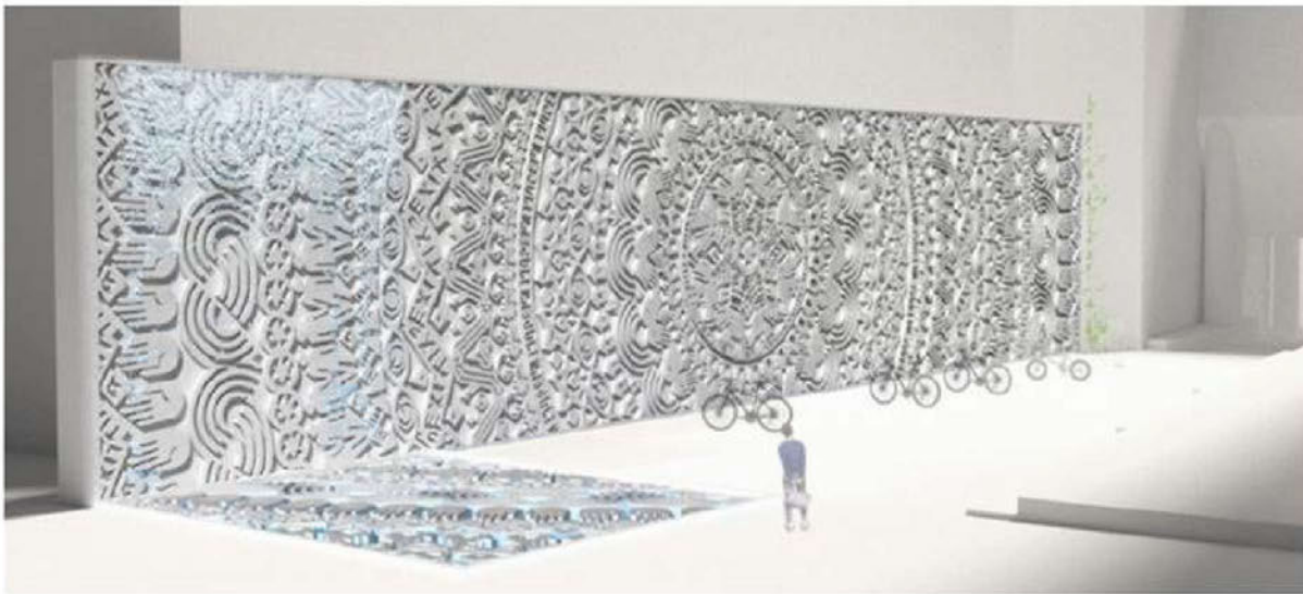
Final Public Art Proposal, "Wheel of Everyday Life", Gunilla Klingberg – Burrard Place (Klingberg Geschwind Studio), Feb 2, 2018