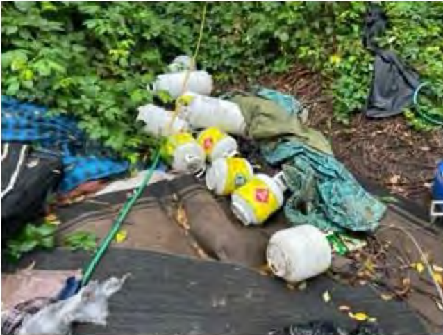
Multiple propane tanks