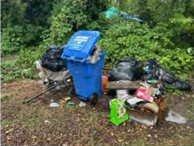
Garbage strewn everywhere within 20 yards of