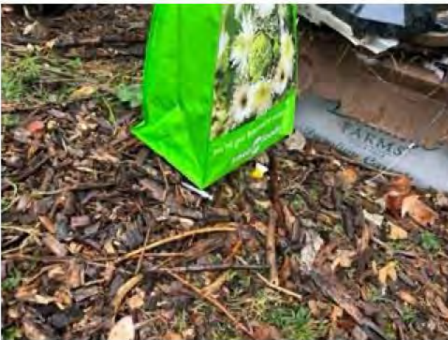
Uncapped needle next to pathway