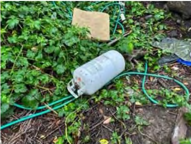
additional propane tanks