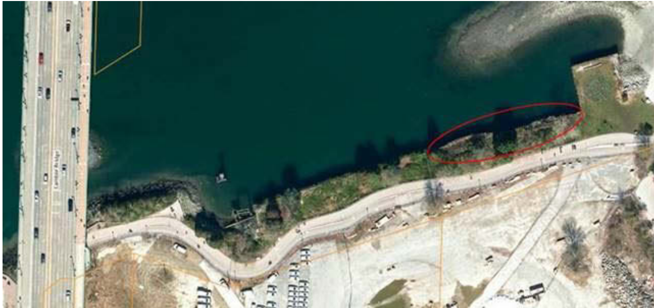
Fig. 1 – Cambie sheetpile wall: approximate area of concern shown in red

Please contact Lon LaClaire if you have any additional questions.