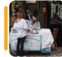
Dedicated space to support businesses' patios and merchandise displays