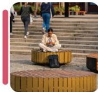
Variety of public seating and planters