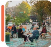
Flexible open space with movable furniture for community programming and events