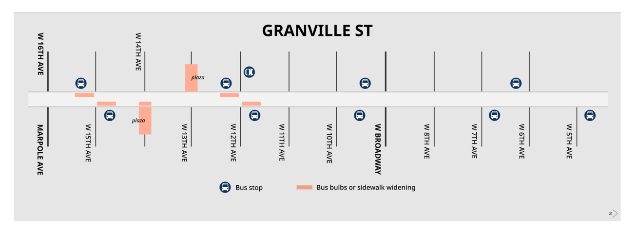
Appendix B: Bus Bulbs and Sidewalk Widening on Granville St Planned for 2025