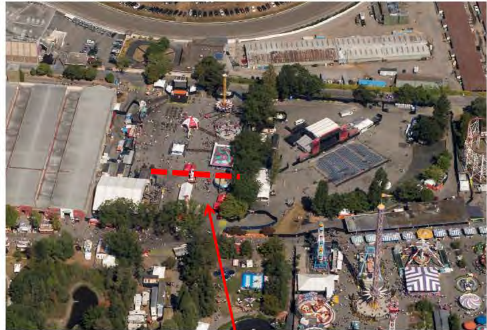
Phase 1: New wiring from Festival Plaza to the Amphitheatre