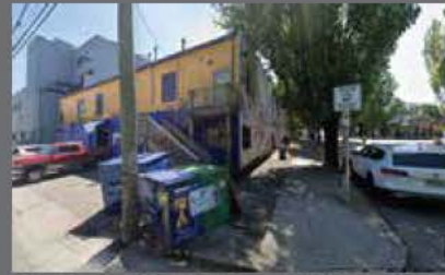
Go Green Bottle Depot & Recycling Operator: Save Planet Home Inc 7 E 7th Avenue