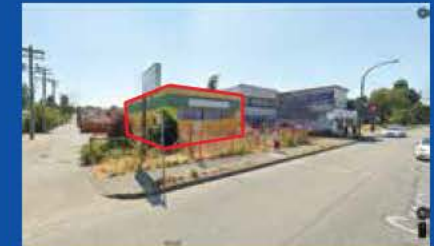
Proposed Grandview Return it Centre – DP and BP Issued 2890 Grandview Highway