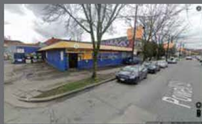
Powell Street Return-It Bottle Depot Operator: K & J Bottle Depot Ltd 1856 Powell Street *Lacks current business licence