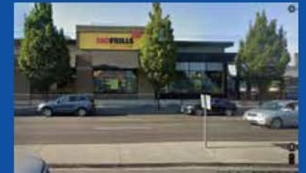
Proposed Express & Go Container – DP and BP issued 1460 E Hastings Street