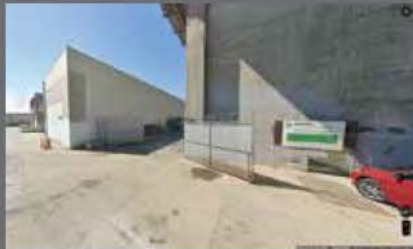
Halton Recycling Ltd. 955 W Kent Avenue N