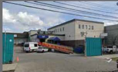
United We Can Bottle Depot Operator: 590275 BC Ltd 449 Industrial Avenue