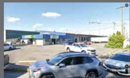
Regional Recycling - Vancouver Operator: 682393 BC Ltd 960 Evans Avenue