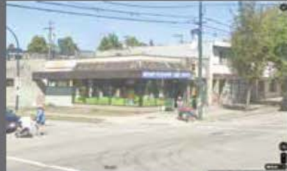
Mount Pleasant Return-It Depot Operator: K & J International Marketing 501 E Broadway