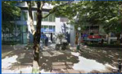
Return-It Express Yaletown 1387 Richards Street