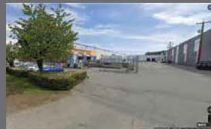
South Van Bottle Depot Operator: South Van Bottle Depot (Zim's) Ltd 34 E 69th Avenue