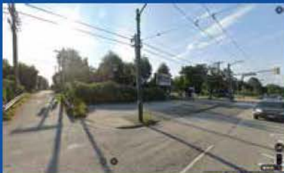
Proposed Express & Go Container – DP issued 3170 Arbutus Street