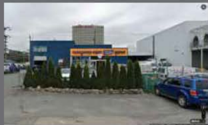
Vancouver West Return-it Depot Operator: Vancouver West Bottle Depot Ltd 1253 W 75th Avenue