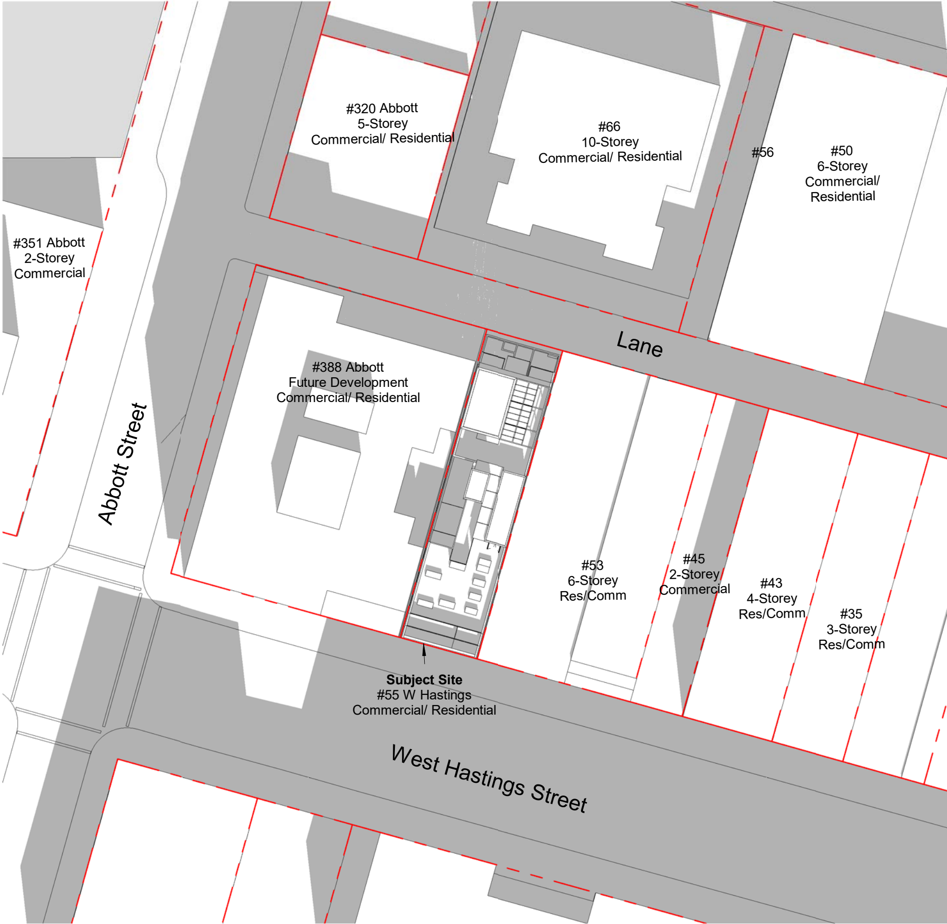
2 Equinox (Mar/Sep 21) Noon SCALE: 1" = 40'-0"