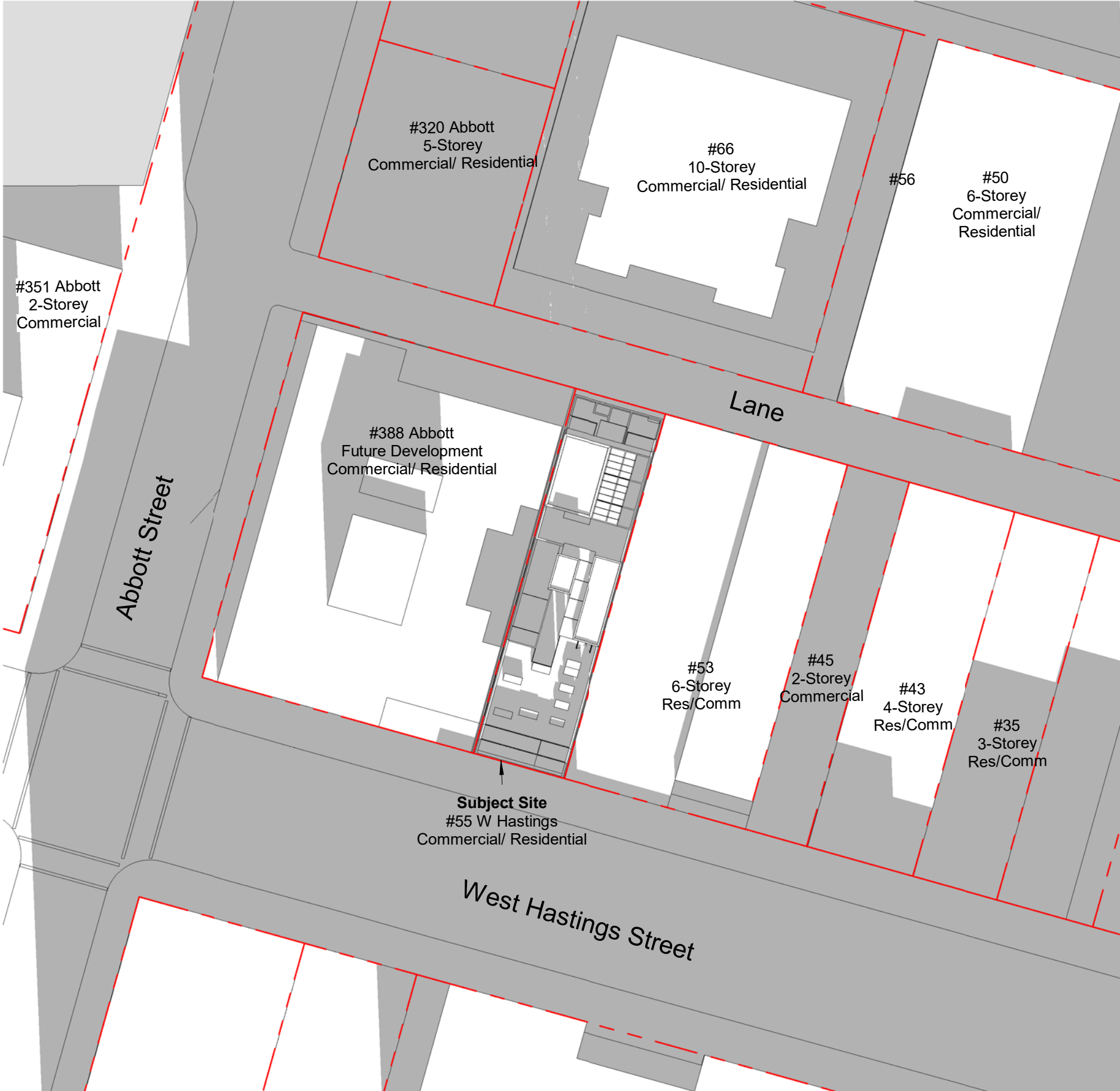
5 Winter Solstice (Dec 21) Noon SCALE: 1" = 40'-0"