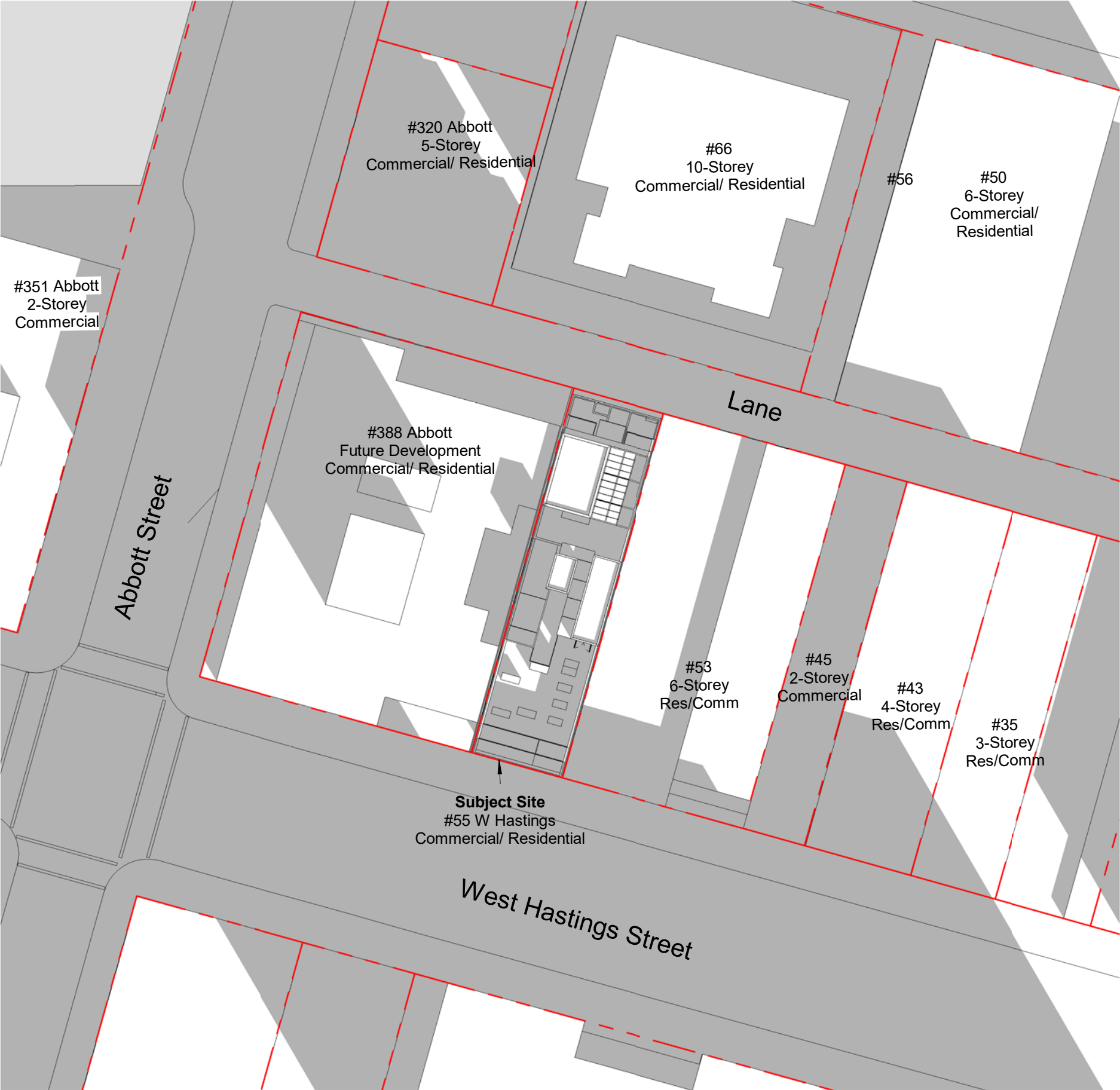
4 Winter Solstice (Dec 21) 10 am SCALE: 1" = 40'-0"