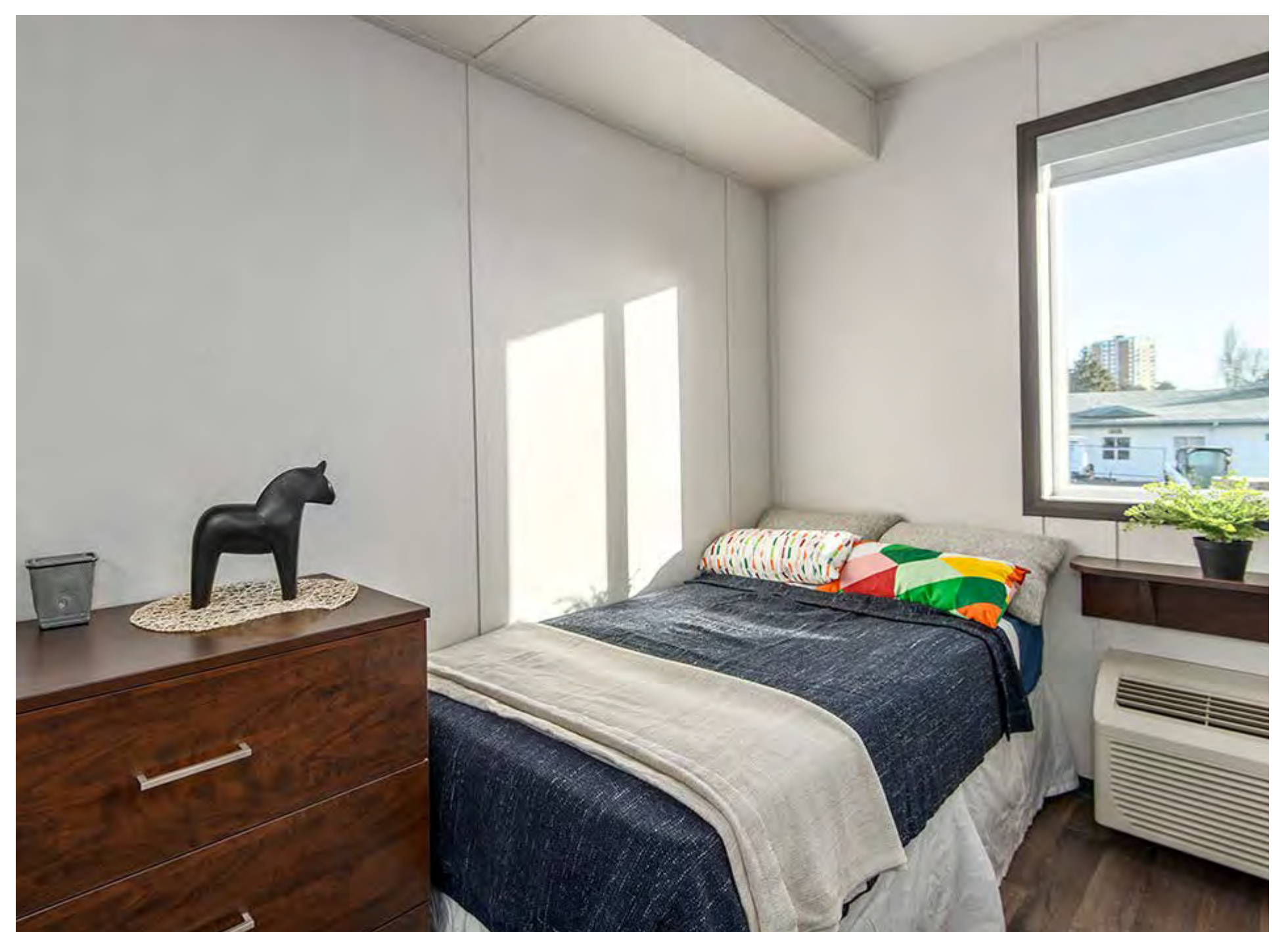
7430 & 7460 Heather Street