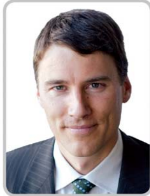
Mayor Gregor Robertson