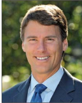
Mayor Gregor Robertson