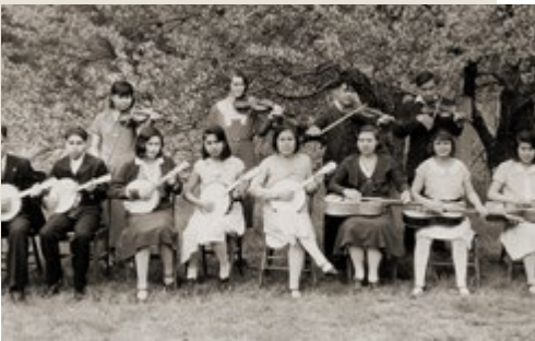
Alberni IRS orchestra, c. 1930.

When they arrived, the staff took away the children's clothes and cultural belongings. The children's hair was cut and they were required to wear uniforms of Euro-Canadian clothing. Children did not get enough food and lived in poor quality buildings that were hot in the summer and cold in the winter. The overcrowding and malnutrition meant that