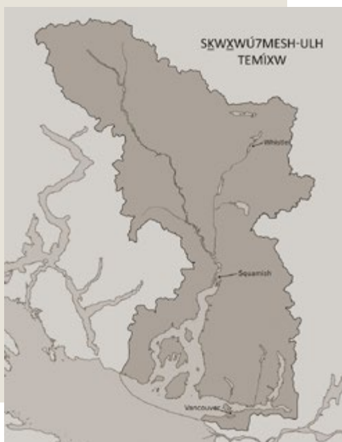
Map of Squamish Territory. Created by OldManRivers for Wikimedia. Released under CC-by-2.0

“Our society is, and always has been, organized and sophisticated, with complex laws and rules governing all forms of social relations, economic rights and relations with other First Nations.”