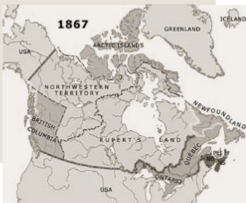
Map of the Dominion of Canada in 1867.

Aboriginal resistance to the Indian Act is supported by many international human rights organizations: Amnesty International , the United Nations , and the Canadian Human Rights Commission have called the Indian Act a human rights abuse. 27