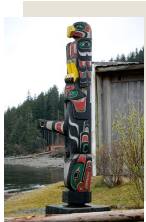
Totem pole at Alert Bay.

A potlatch is a formal ceremony used by First Nations on the north-west Coast of North America. The Potlatch is the essence of the culture as it is the cultural, political, economic, and educational heart of the nation. A potlatch may be held to recognize and celebrate births, marriages, deaths, settle disputes, totem pole raising, giving cultural names, passing on names, songs, dances, or other responsibilities, or formalizing aspects of relations between families or communities. 14 Potlatches are large events that can last several days. They often include two important aspects: the host giving away gifts and the recording, in oral history, of the events and arrangements included in the ceremony. Potlatches are also a way to redistribute wealth as