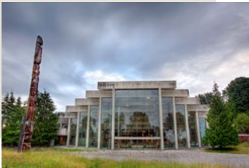
Gulf of Georgia Cannery.