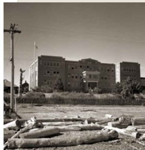
View of Indian Residential School in Alert Bay. Date unknown.

One of the largest class action suits in Canadian history was settled in 2007. It resulted in the establishment of the Residential Schools Settlement and payment of $1.9 billion. This settlement made several promises. It gave more funds to the Aboriginal Healing Foundation (now closed) for healing programs in communities, 13 and offered payments to survivors as reparation. Reparation payments are compensation for past wrongs endured by the victims. The Residential Schools Settlement also set up a process in which survivors could be granted more money if they could prove particular abuses, and provided funds for commemorative projects. The settlement included a government apology made in the Parliament in 2008 by Prime Minister Stephen Harper on behalf of the federal government. It also established the Truth and Reconciliation Commission . You can read about the Truth and Reconciliation Commission in Chapter 12 .