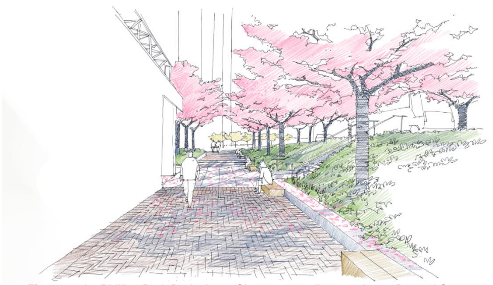
Figure 2: Art Phillips Park Redesign – Cherry tree walk extension to Burrard Street

The concept design being presented as part of the public engagement also focuses on preserving and extending the popular row of cherry trees through the park to Burrard Street (see Figure 2), making improvements to site accessibility, adding seating to support park and transit users, and creating open space to support site programming.