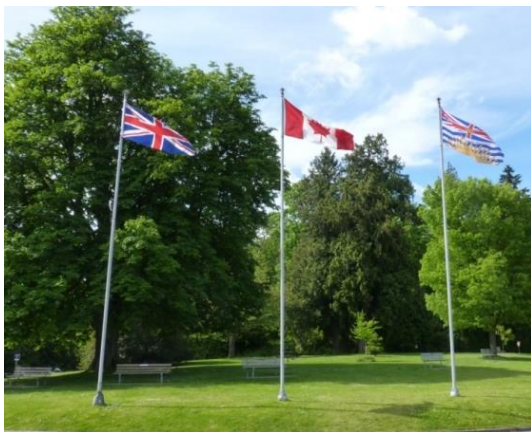
Figure 1 - Original Brockton Point Flag Poles

On April 28, 2017, Park Board Operations staff attended a SPIWG meeting to discuss the need to replace the three flagpoles at Brockton Point (see Figures 1 & 2 for images of the original flags and location). The poles, installed in the mid 1960's, were in poor condition and had become a safety risk. The working group approved the replacement of the poles, contingent on archeological protocols being followed. The three new poles were installed in late 2019 and are now ready for new flags.