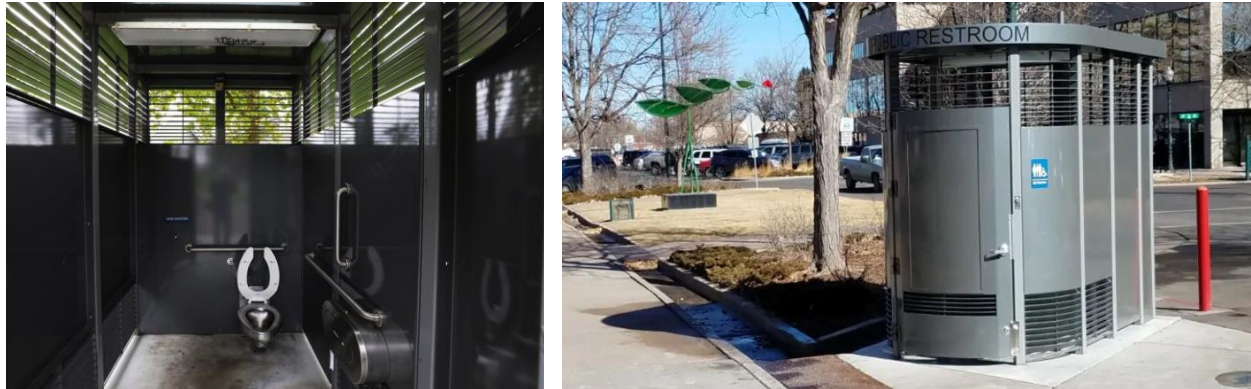
Figure 1: Portland Loo Interior & Exterior Images

Once the fieldhouse is demolished, the plan is to install two Portland Loo units using the site's existing water and sewer utilities. The estimated cost for the two units is approximately $500,000. Due to their prefabrication and ease of install, staff estimate that the Portland Loo pilot project could be operating in the park in as little as six months.