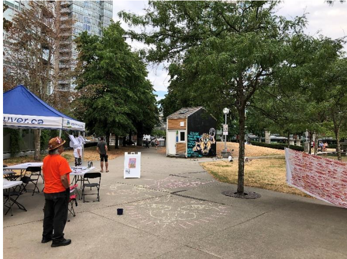
OPS Tiny House Art Studio – Andy Livingstone Park

The Overdose Prevention Society (OPS) is a community partner in the Our Park Project. Early in the summer of 2021, they approached the Park Board Arts Team to site an architect-designed and built tiny house, donated to OPS to use as an art studio, in Andy Livingstone Park in conjunction with the Our Park Project. Staff saw placing the studio in Andy Livingstone as a short-term initiative that would work well in tandem with the Our Park project. OPS has full responsibility for upkeep, insurance and access of the studio. Park Board staff are continuing our collaboration with OPS and we are researching a more permanent placement for the tiny studio. The Tiny House Arts Studio supports Downtown Eastside artists with experience in drug use with a safe place to store art supplies and work on drawing and painting projects.