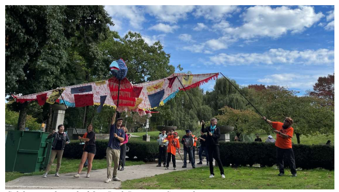
Celebrating the end of Our Park Project in September

In the summer and fall of last year, the Park Board led the Our Park Project at Andy Livingstone Park, in partnership with Vancouver Coastal Health and local non-profit organizations. This project connected people who use the park through a community-based arts and harm reduction lens. Over many sessions, people came together to work side by side, drawing and printmaking as they learned each other's stories. Peer outreach workers also supported harm reduction activities in the park. The project's aim was to built familiarity, connection and community resilience among groups such as Crosstown school families, residents including representatives from False Creek Residents Association, seniors in Chinatown, people with lived experience of drug and alcohol use, and many others.