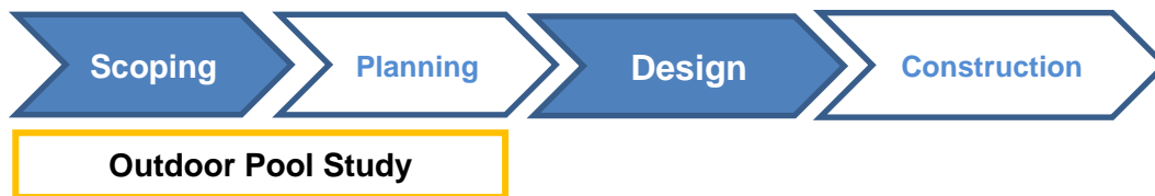
Figure 2: Outdoor Pool Study & Project Process/Phases

The ongoing work includes archaeological, geotechnical, environmental, and cultural assessments. The outcome will provide high-level cost estimates to inform capital planning deliberations for both a Mount Pleasant Outdoor Pool and a renovated Hillcrest Outdoor Pool, along with their associated amenities (e.g. change rooms and washrooms). The Outdoor Pool Study does not include public engagement, as it relies on engagement conducted during VanSplash. Future engagements will be a component of the design phase (see Figure 2 below for project phases).