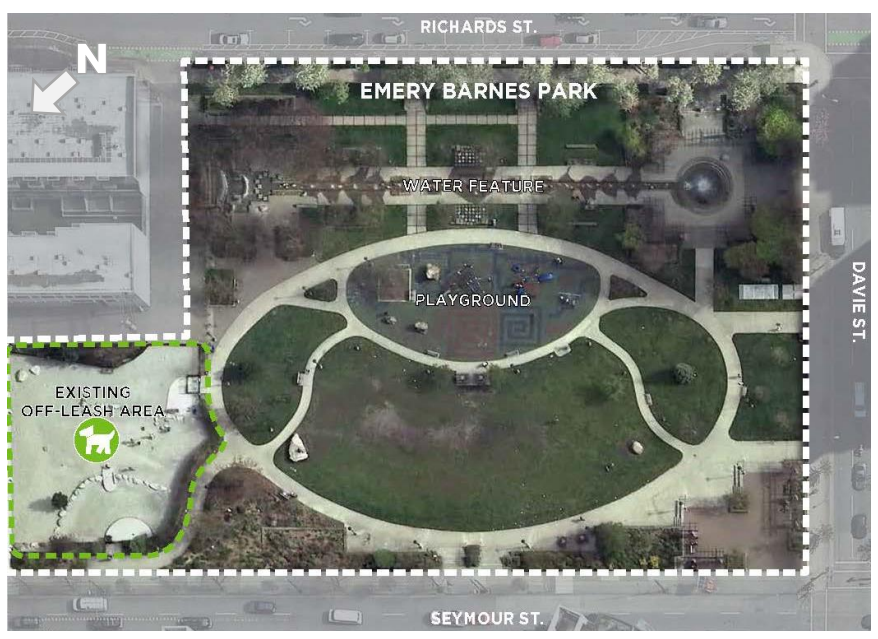
Figure 1: Emery Barnes Park – Dog Off-Leash Area (Downtown South)

The off-leash area at Emery Barnes Park (see Figure 1) was built in 2010 and serves as one of the most conveniently located urban dog parks for Downtown South residents. With the neighborhood's high population density and large proportion of dog ownership, this site is in need of upgrading as it no longer meets the current service levels and demands placed upon it. Staff have also identified a number of functional challenges and have received considerable feedback from park users on the need to improve the dog facility.