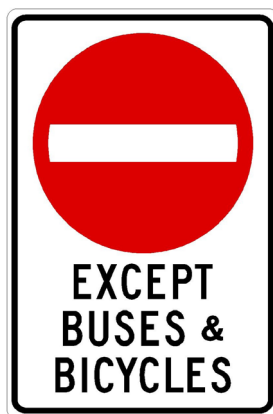
Initial signage on Charleson

During the monitoring period, staff will conduct traffic counts on nearby streets and review public feedback. If the closure meets the project objectives, the temporary barriers will be replaced with a permanent design.