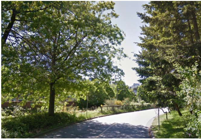
Photo: Charleson, looking west at Moberly Road

In our fall 2015 phase, we asked participants whether they felt closing Charleson to non-transit vehicle traffic would improve conditions on the South False Creek Seawall. Nearly 50 per cent felt it would, while only 22 per cent felt it would not (the remainder answered "unsure/don't know").