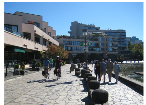
Photo: Seawall near Stamps Landing

If you have any questions about this process, please call 3-1-1 to be directed to the staff team.