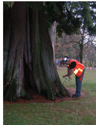
An arborist assesses the amount of decay in a large tree near Malkin Bowl.

Information pertinent to the tree condition, and the recommended corrective action, are recorded and stored. Worksheets can be produced from these records. Photographs or other forms of historic record-keeping tools are used where appropriate.