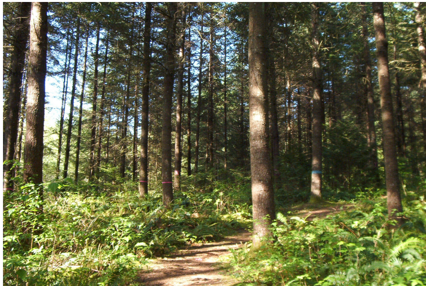
A plantation of the same age with only 250 stems per hectare: trees are more wind-resilient, and the forest floor has profuse growth. (Malcom Knapps Research Forest)