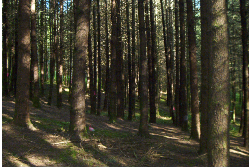
A 35-year-old forest plantation with 500 stems per hectare: the trees are losing their crown depth, and little or no light penetrates to the forest floor.

Assess impacts of thinning treatments and make necessary adaptations to thinning regimes.