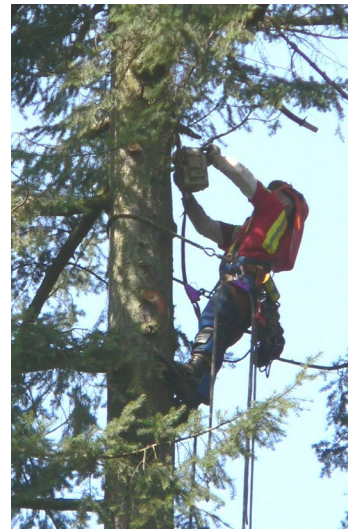
Pruning can decrease likelihood of wind throw in high risk areas.