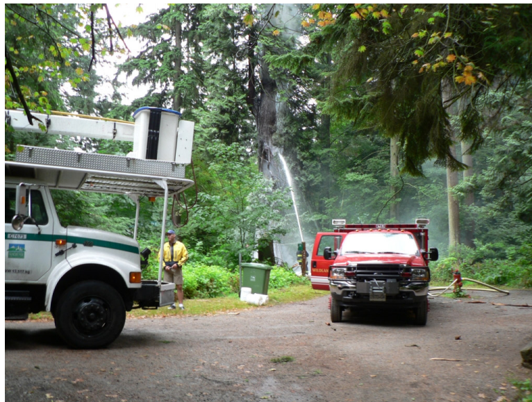
Vancouver Fire and Rescue Department responds to a fire caused by lightning.

In areas where ignition probability and potential consequences are high, consider the trailside removal of low branches and dense hemlock scrub growth that create a fuel ladder effect within areas of fuel types of C2, C3, and C4.