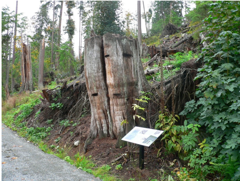
One of 36 interpretive signs placed around the park in wake of 2006 windstorms.