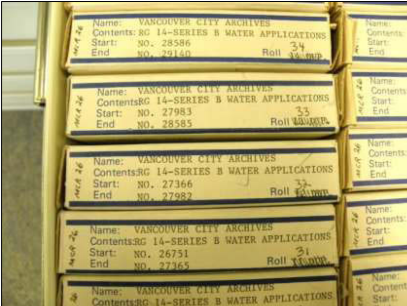
MCR 26 microfilm—look for your application number