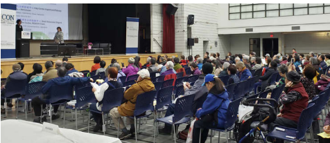
Participants in the iCon health forum packed the David Lam Hall at the Chinese Cultural Centre

Over 200 people, including seniors, families and caregivers joined health professionals at a health forum in Chinatown on February 22 to learn how patients can prevent or manage chronic conditions, such as arthritis and osteoporosis, and stay healthy at home.