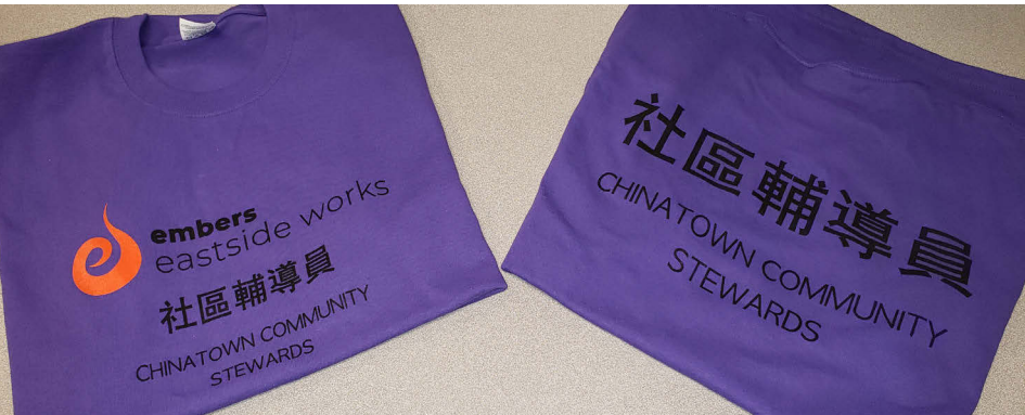
Specially-designed T-shirts for community stewards

Under the six-month pilot, Downtown Eastside residents have been recruited, trained and employed as stewards working throughout the week in two shifts in Chinatown. Their duties include: needle removal, keeping doorways of businesses clear and ready for operation, liaising with local merchants and non-profits around community concerns, reaching out to individuals living in the community who require other supports. The work