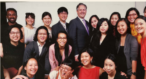
Representatives of the Hua Foundation with Mayor Kennedy Stewart at the award ceremony

The awards recognize the outstanding achievements by individuals and organizations that benefit people by making Vancouver more green, healthy, diverse, and accessible.