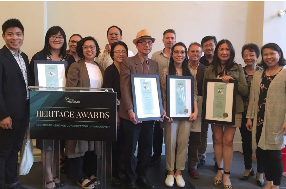
Recipients of the 2019 Heritage Awards.

Chinatown BBQ, also a recipient of this year’s Heritage Award, was recognized for translating intangible cultural values into a physical setting with economic benefits and contributing to local community