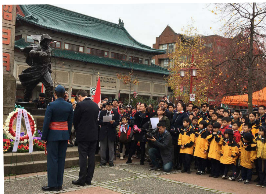
Community members of all ages attending the Remembrance Day ceremony in Chinatown

In addition to commemorating Canada's wartime sacrifices, peacekeeping duties and their involvement in regional conflicts, the ceremony also pays tribute to the struggles and hardship endured by early Chinese settlers since the Memorial Square is dedicated to honouring both Chinese pioneers and military veterans of Chinese descent.