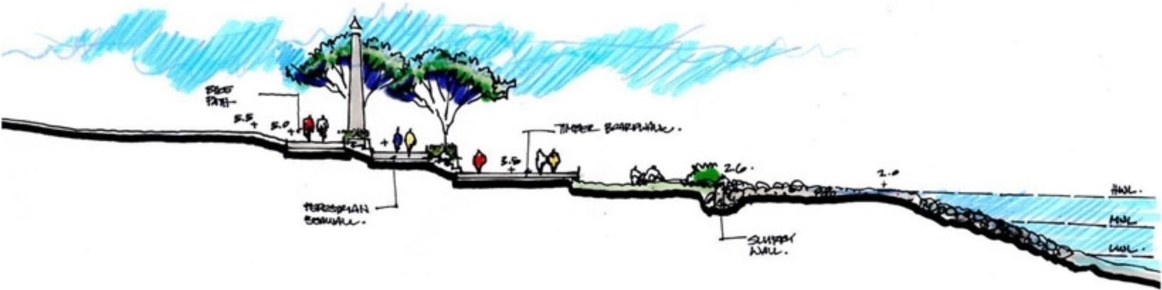
SECTION AA - SEAWALL AND BEACH