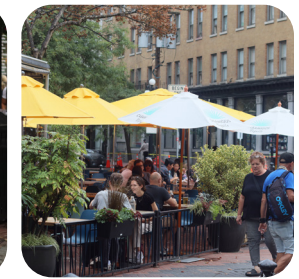
Dedicated space to support businesses' patios and merchandise displays