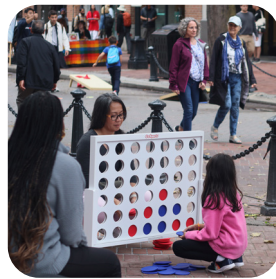
Flex space with movable furniture for community programming and events