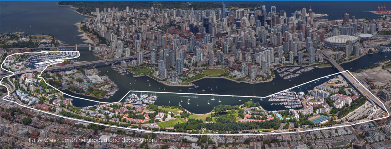
False Creek South neighbourhood (looking north)