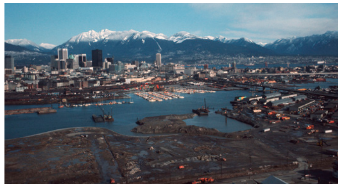
False Creek South pre-development (1970s, looking northwest)

When this neighbourhood was first built in the 1970s and 1980s, much of the land was leased by the City to tenants via 60-year leases, with most of these leases expiring in the next 15 to 25 years. No new housing has been built in False Creek South since the 1980s.