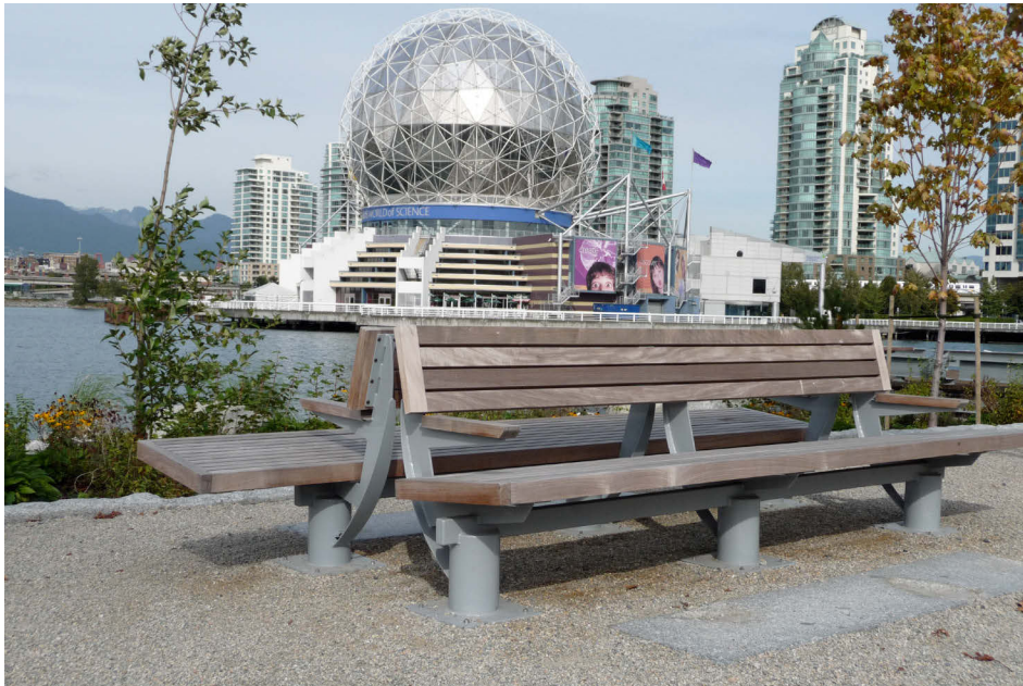
SEFC WATERFRONT BENCHES. SEE LANDSCAPE FURNISHING KEY PLAN FOR PROPOSED LOCATIONS OF BENCHES

The developer is encouraged to utilize the SEFC benches and or modified benches on the private parcel areas and zones that are in close proximity to the public realm. Areas where these benches or modified benches are suggested include street or entry plazas off sidewalks, lane plazas, and corner plazas.