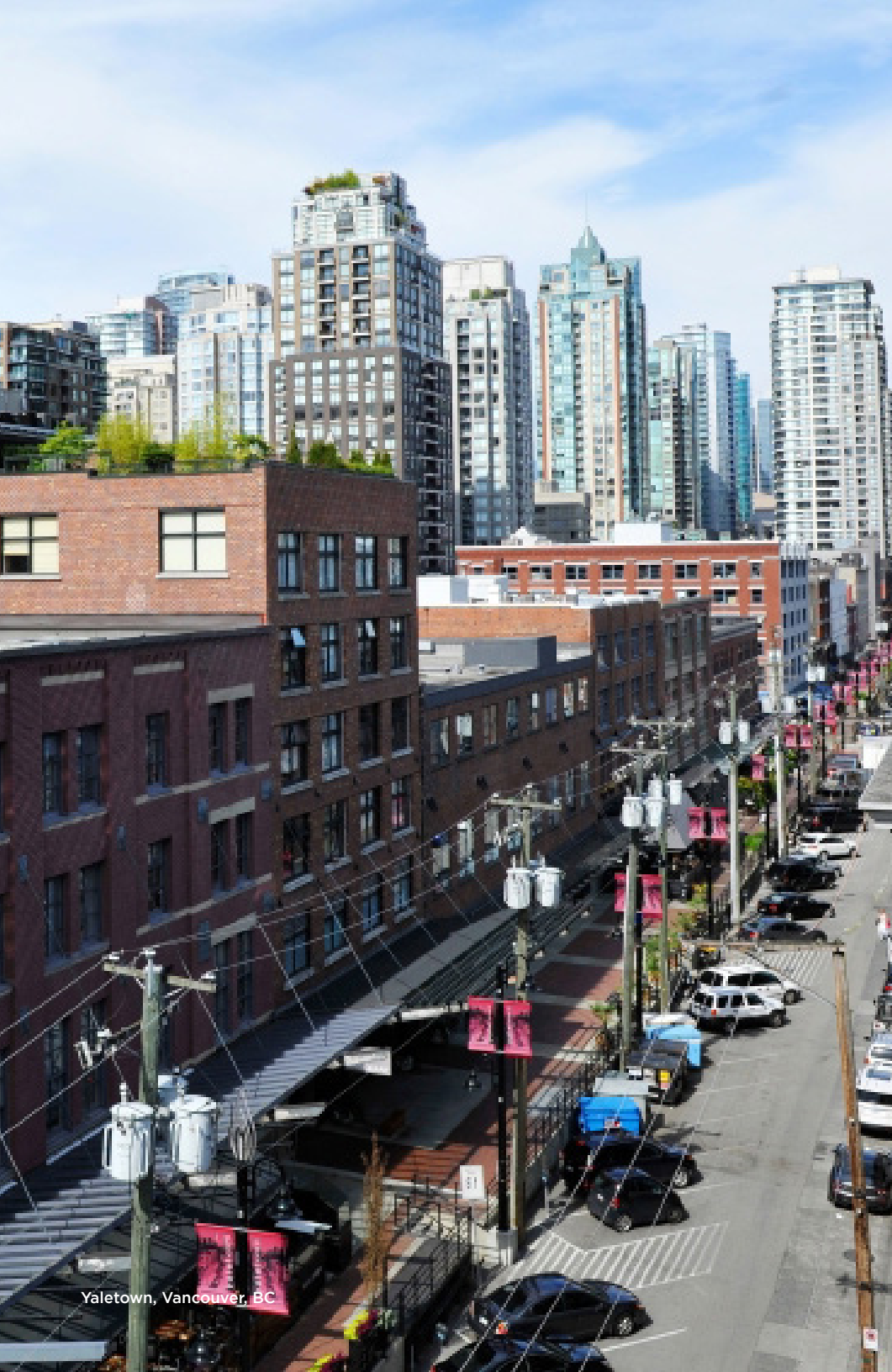
Yaletown, Vancouver, BC