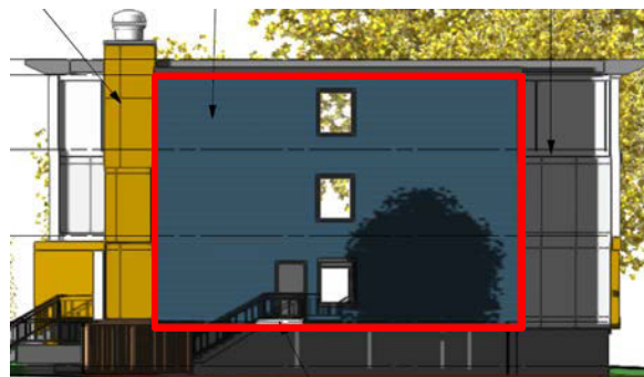
West elevation facing Main Street