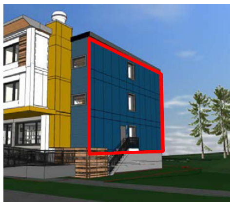
Perspective looking Southeast from Union Street