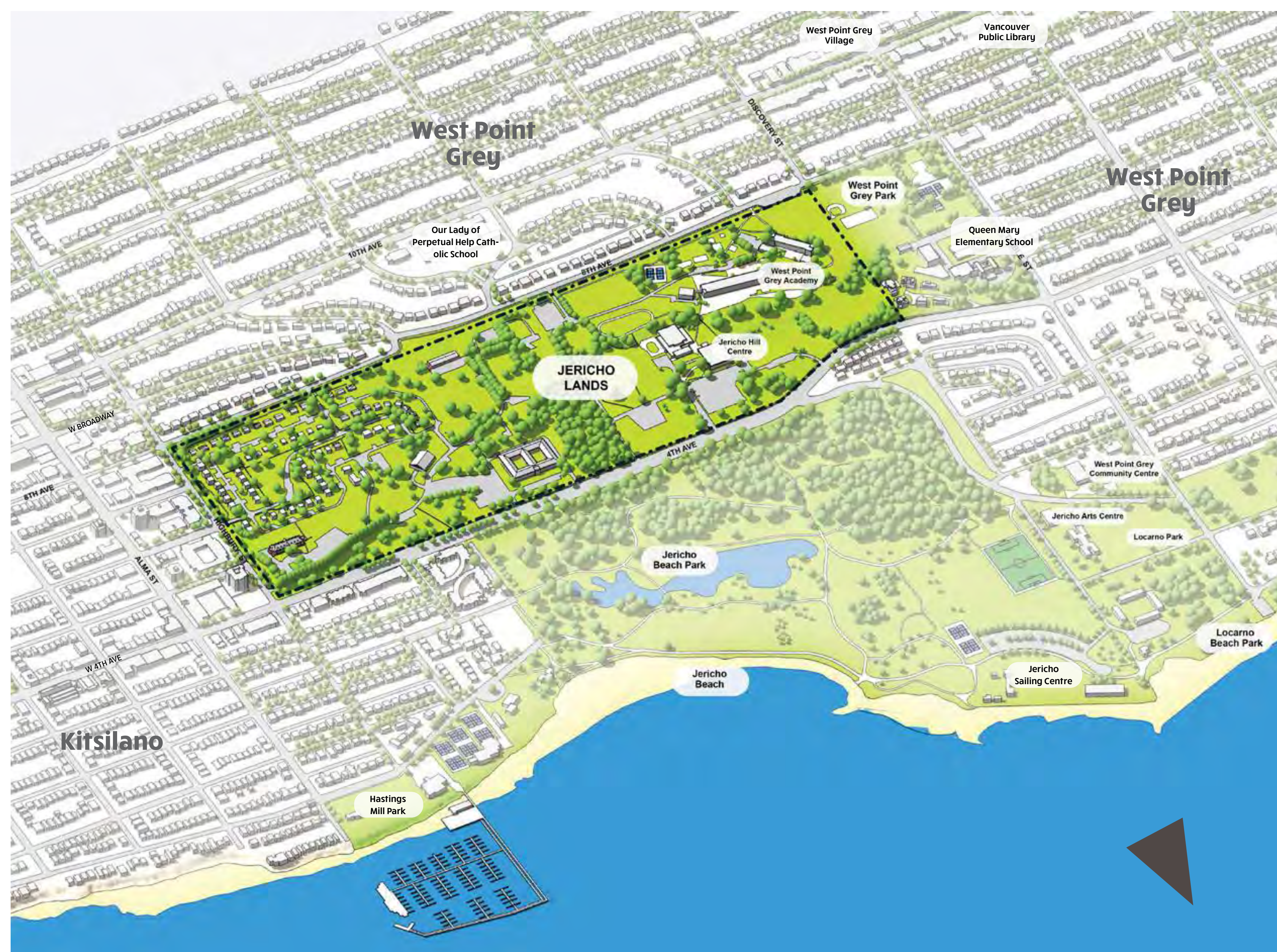
Illustration showing the existing Jericho Lands site in context of the surrounding community. (Image created by Urban Strategies Inc.)