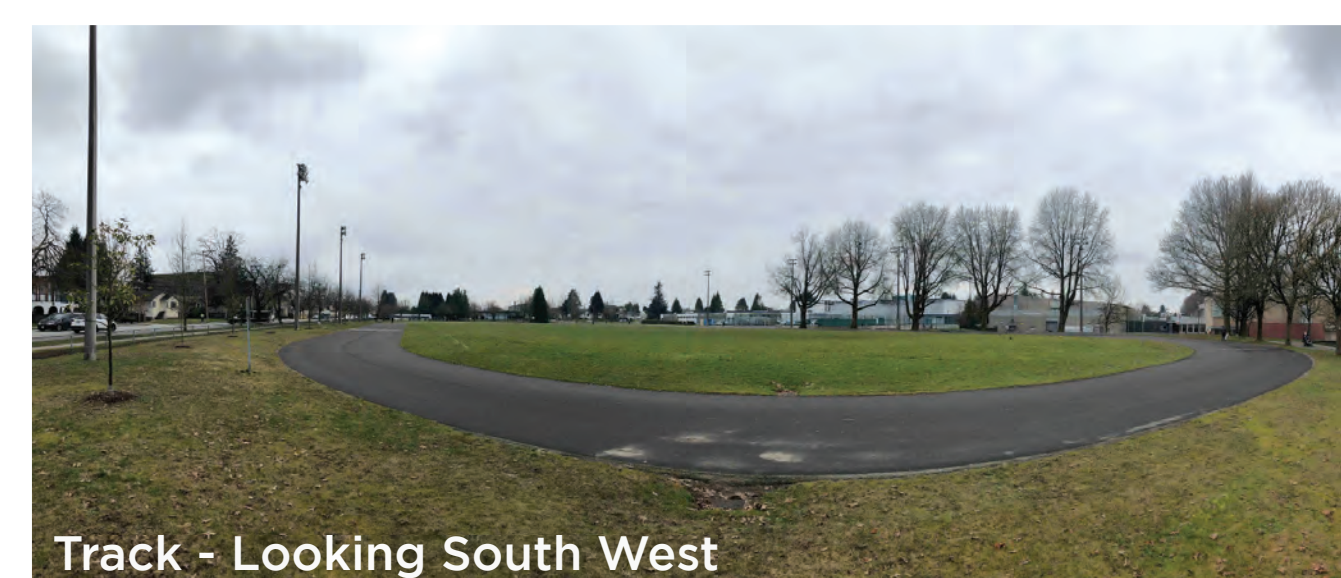
Track - Looking South West