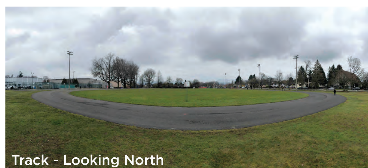
Track - Looking North