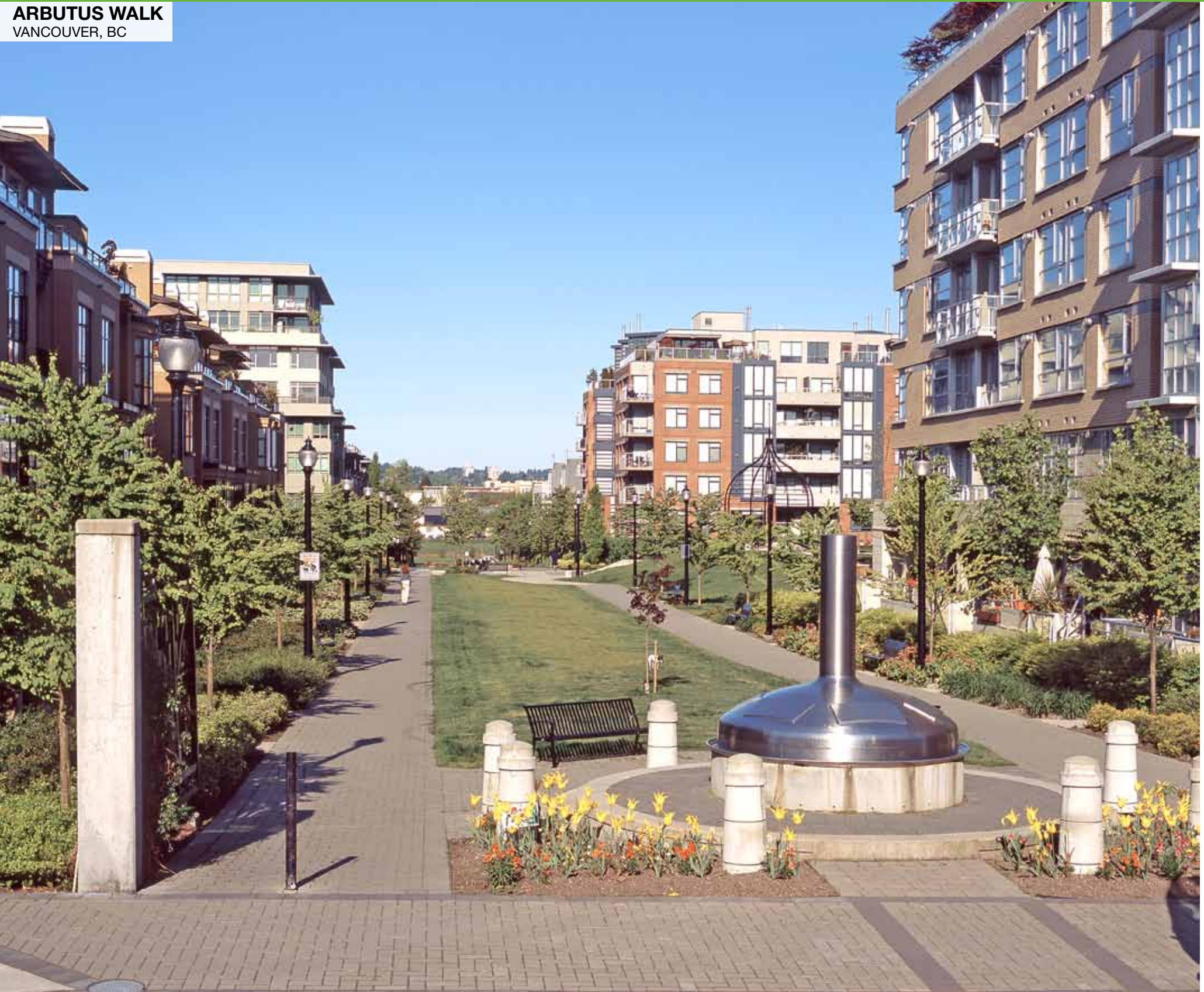
ARBUTUS WALK VANCOUVER, BC