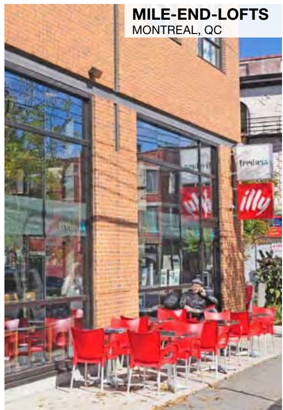
MILE-END-LOFTS MONTREAL, QC