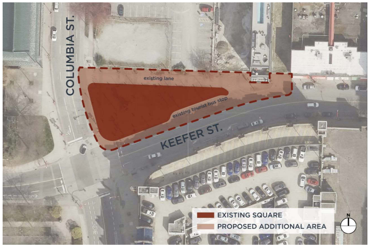
Figure 1 – Increased Area for Chinatown Memorial Square