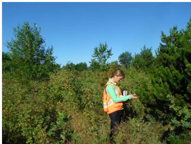
Biologist conducting an environmental study for the Habitat Enhancement Program

The project team is also considering the inclusion of ecological or geographical information for educational/interpretive signage. Ecological information could include: descriptions or images of the species of vegetation planted and the species of fish and wildlife expected to use and benefit from the restored habitat area; and overall ecological benefits of tidal marsh habitat. Geographic information could include a map showing New Brighton Park in relation to the surrounding region.