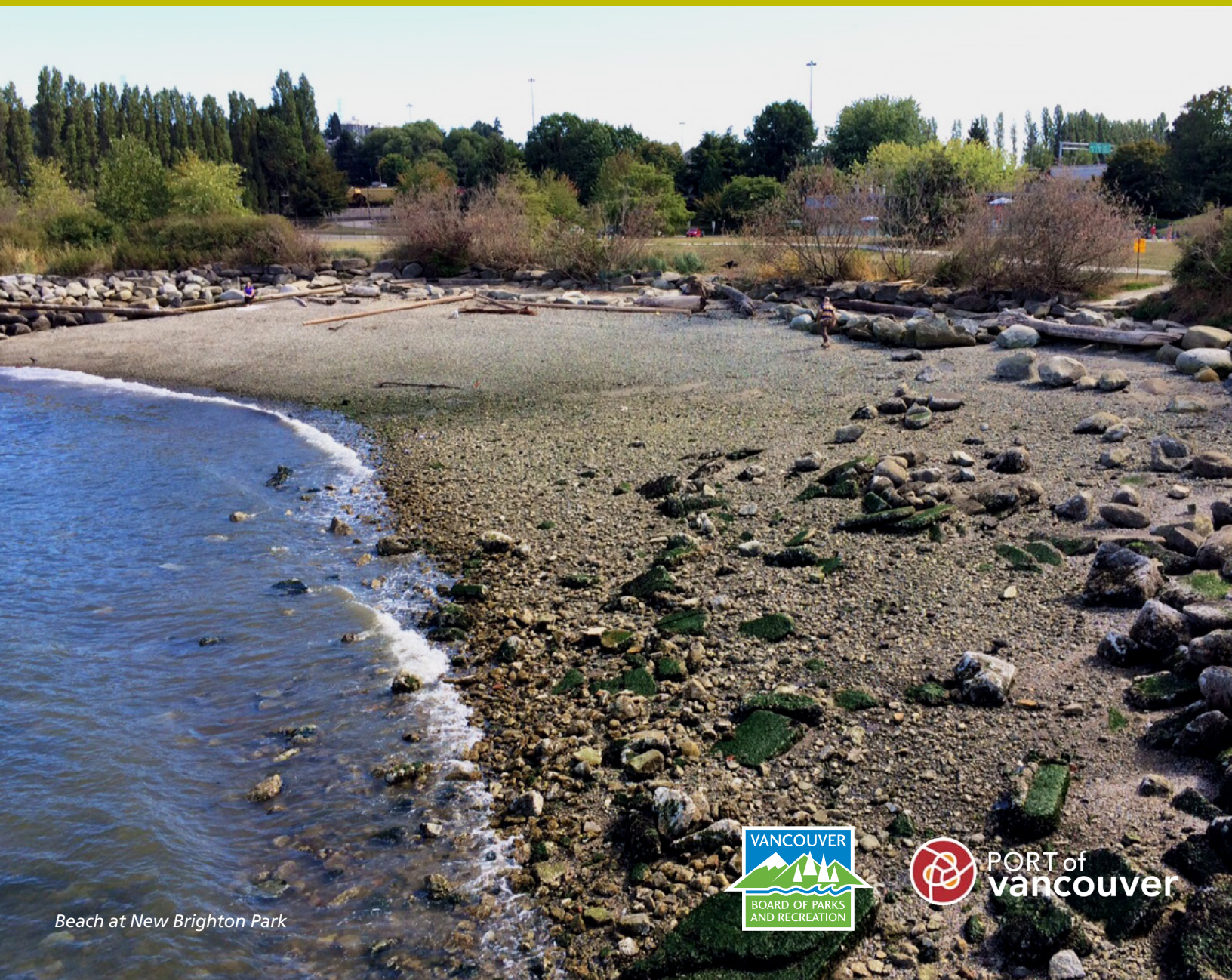
Beach at New Brighton Park