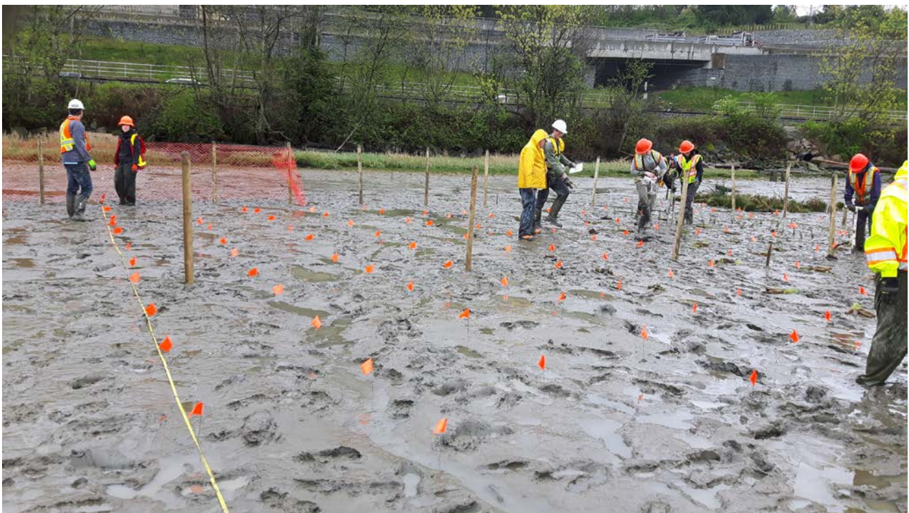
Planting for a Habitat Enhancement Program project in the South Arm of the Fraser River

A description of construction activities would be prepared prior to the start of construction, and would include the proposed construction period, hours and method of construction, as well as a description of the staging activities and work areas.