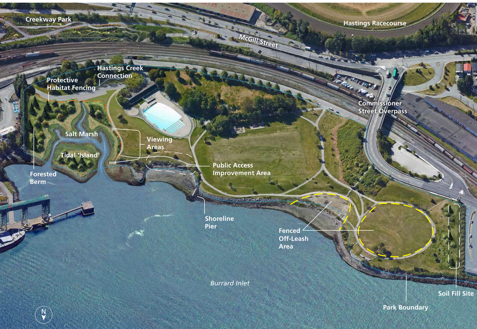
Illustrative Concept at low tide