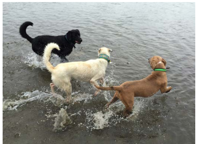
Dogs playing in the water at New Brighton Park

Based on this feedback, the project team proposes to improve public access to the east beach, so that park users can better access and enjoy this beach. Access to the east beach will be improved by adding or upgrading stairs and providing benches and picnic tables upslope of the beach.