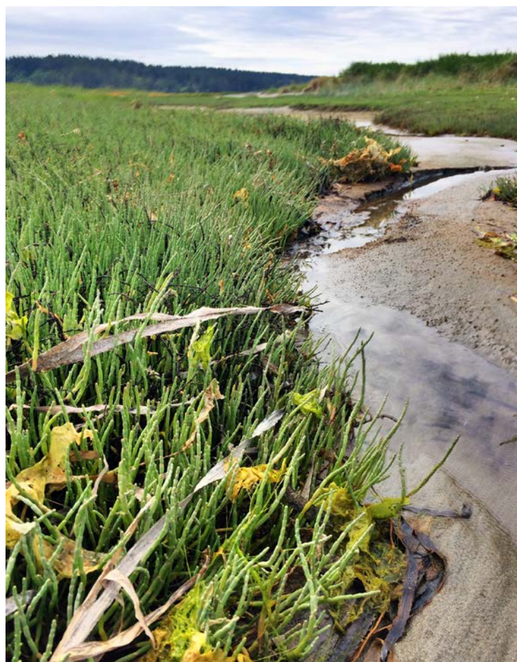
Image of an existing Salt Marsh, Sidney Island B.C.