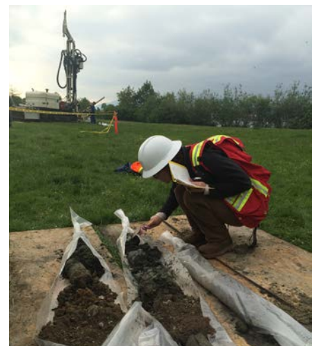
Soil sampling at New Brighton Park